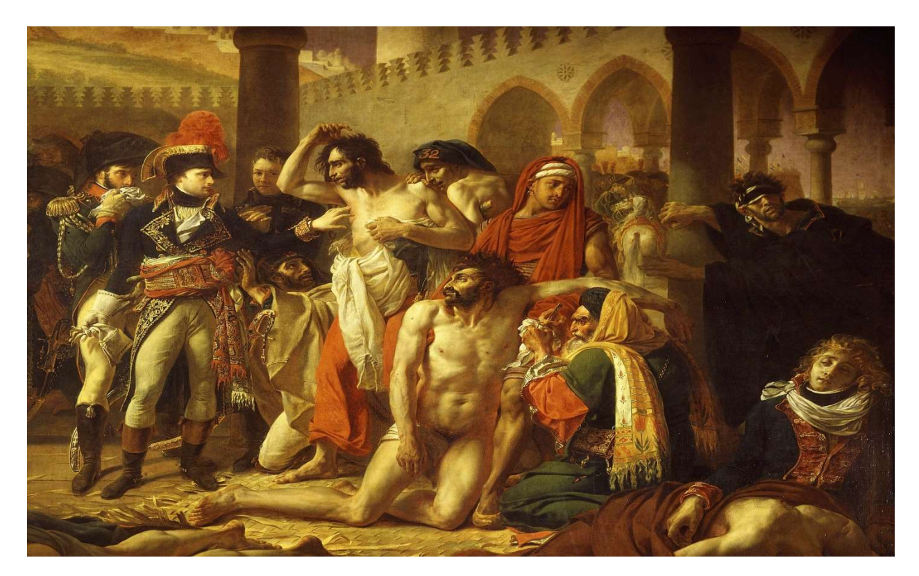
FIGURE 2. Bonaparte Visiting the Pesthouse at Jaffa (1804) Credit: [The Art Archive / Musée du Louvre Paris / Collection Dagli Orti] Ref: AA347789