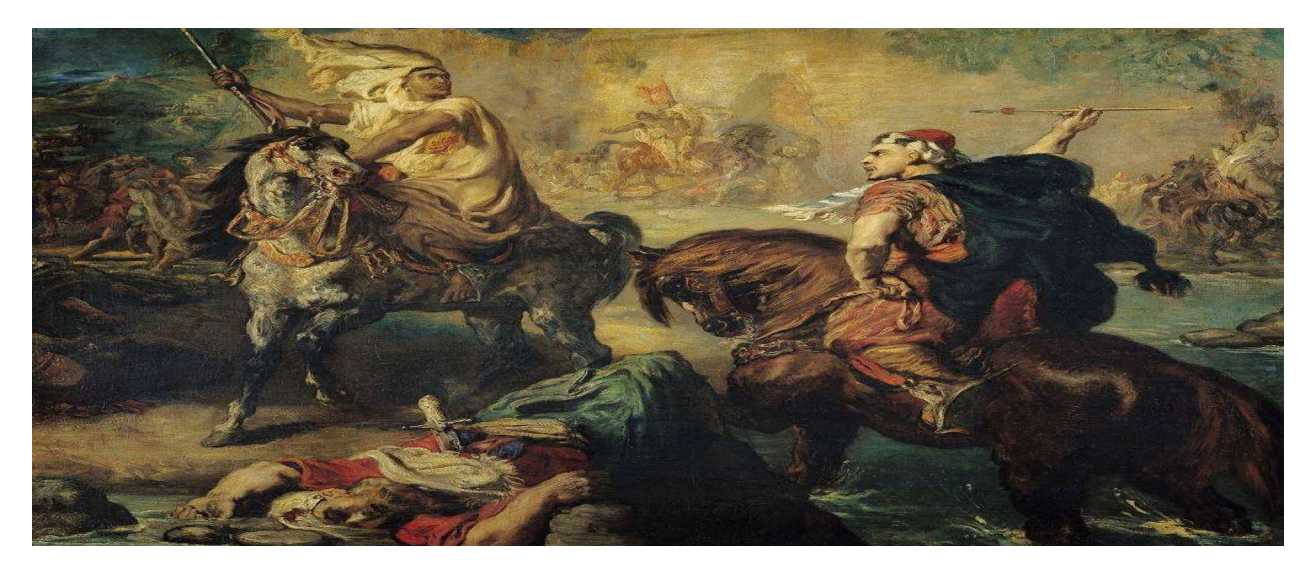
FIGURE 3. Arab Chiefs Challenging to Combat under a City Ramparts (1852) Ref: AA543599

In a century and a half between 1800 and 1950, roughly 60,000 books were published in the West on the Arabs in the Orient (Nader, 1989). The key theme of these books was the depiction of colonized Arabs/ Muslims as uncivilized and inferior in dire need of the progress proffered to them by the superior colonizers. It is in this political context that images of veiled Muslim women and women in harems appeared as a source of captivation and fantasy for western writers (Hoodfar, 1997). Harems were depicted as places where Muslim men jailed their wives to gratify their sexual needs. Women were constantly portrayed as submissive beings, naked or half-naked, in search of sex. All these images of exotic harems, bare-breasted women and the