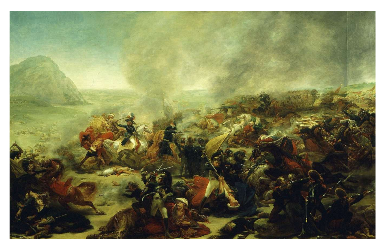
FIGURE 1. Battle of Nazareth (1801) Ref: AA377969