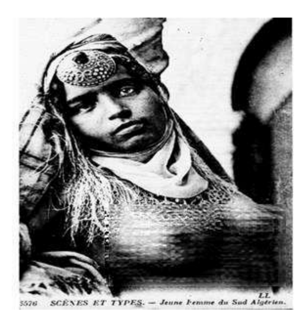
FIGURE 5. Typical image of an Algerian woman on a postcard. Taken from Alloula's Colonial Harem (1986) University of Minnesota Press

It is evident that the practice of representation is only feasible in the context of colonialism because of the difference of power between the colonizer and the colonized. According to Bhabha colonial discourse which "employs a system of representation" is a "form of governmentality that in making out a 'subject nation', appropriates, directs, and dominates its various sphere of activity" (1994, p. 101). It is specifically the representation of the colonized constructed by the colonizers that "justifies conquest and establishes systems of administration and instruction" (1994, p. 101). The practice of representation is "an apparatus of power" (1994, p. 100) which constricts the dependency of the colonized; it is a means of having a comprehensive control over the colonized. Representation per se cannot make the colonized inferior; rather, when it is only practiced as stereotypical it can be used as a means of bereaving one of authority. Colonial discourse as a system of representation "seeks authorization for its strategies by the production of knowledge of colonizer and colonized which are stereotypical" (Bhabha, 1994, p. 101). As Bhabha argues "the stereotype ... [is] the lenses through which the Orient is experienced, and they shape the language, perception, and form of the encounter between East and West" (1994, p. 104). These stereotypes gain their power from repetition, especially repetitions of representation of difference.