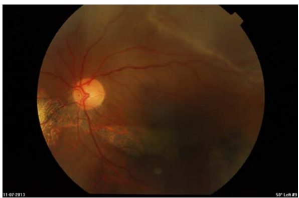
Figure 1: Left fundus photograph showing superior rhegmatogenous retinal detachment involving the macula

emphasizes the importance of patient counselling as to the symptoms of retinal redetachment and the need for immediate presentation even after surgery has already been performed previously.