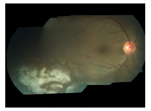
Figure 2: Resolving retinal lesion at one month following treatment

pupillary defect. Anterior segment examination was unremarkable. Right fundus showed haemorrhagic retinitis inferotemporal vessel presence of vitreous condensation (Figure 1). CMV retinitis was confirmed by positive polymerase chain reaction (PCR) from vitreous fluid. Vitreous PCR for Herpes simplex 1 & 2 and Varicella zoster were not detected. HIV serology was negative and she was not diabetic. Her absolute lymphocyte count was 0.67 x 10<sup>9</sup>/L. The patient was started on daily intravenous Ganciclovir 5mg/ kg BD for two weeks and biweekly intravitreal Ganciclovir 2mg/0.1 ml. Azathioprine was withheld in view that the retinitis was most probably due to immunosuppressive state. Oral prednisolone was reduced to 10mg OD. Her vision improved to 6/9 and lesions resolved (Figure 2). Absolute neutrophil count at the end of antiviral therapy was 2.60 x 10<sup>9</sup>/L while absolute lymphocyte count increased to 1.10 x 109/L. Due to financial reasons and non-availability of oral valganciclovir in our hospital, patient was not able to be