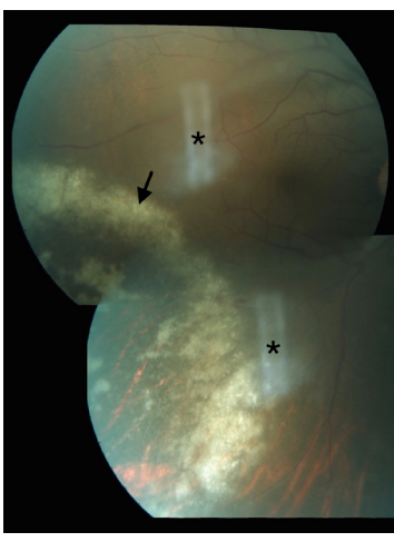
Figure 3: Reactivation of right eye CMV retinitis (arrow) that was approaching the macula. Artifacts were marked with asterisk (*)

incidentally revealed a lung mass. The patient refused for lung biopsy and was diagnosed with presumed stage IV lung malignancy with bone metastasis. She declined chemotherapy and immunosuppressant; and defaulted all follow up. According to the phone interview, her ocular symptoms did not recur. She passed away ten months after the diagnosis of lung malignancy.