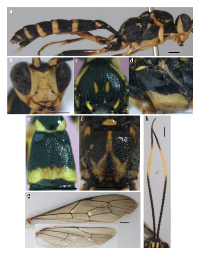
Figure 1. Cratojoppa maculata . a. habitus (lateral); b. head (anterior); c. mesonotum (dorsal); d. mesopleurum; e. post-petiole & tergite I; f. propodeum (dorsal); g. wings; h. antenna. Scales: 1mm.

region, reflecting how little taxonomic work has been done regarding this genera in this region. Distribution record of Cratojoppa maculata showed in Figure 2.