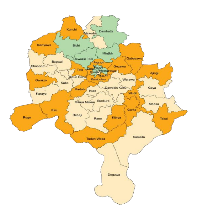
Figure 1.1: The Map of Kano State and its 44 Local Governments

Kano Emirate Council also known as Ma Sauratar Kano <sup>3</sup> has a history that is said to be spanning more than a millennium. This despite the fact that the larger part of the Emirate's history prior to the sixth century was built on myths ( Hogben and Kirk-Greene 1966). The Emir's palace which is the official seat of the emirate council and also known as Gidan Rumfa is one of the most enduring legacies in the history of Kano kinship (Tanko 2014).