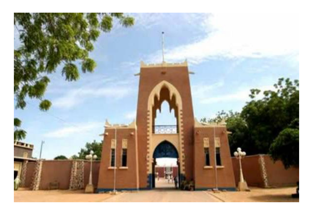
Figure 1.2: Main Entrance to Kano Emirate Council

The current structure of the emirate council according to Blench et al (2006) was established after the defeat of the Hausa ruling dynasty by Sheikh Usman Danfodio between the periods of 1805-1807. The Fulani Jihadists ruled Kano until 1903 when it was also defeated by the British colonialists in 1903. However, before the events of 1805-1807, and 1903, Muhammad Rumfa who ruled the Kingdom between the periods of 1463-1499 under the Hausa ruling dynasty, acting on the advice of a Middle East scholar, Shehu Maghili made attempts to change the administrative pattern of the Kingdom by introducing Islamic constitution in fifteenth century. It is also reported that, the Fulani Jihadists adopted the same constitution that was introduced by King Muhammad Rumfa to consolidate their leadership in the newly established emirate council. Specifically, the Fulani Jihadists re-organized structure of the newly established Emirate Council into districts, villages, and wards with the Emir as the overall head. Each district was headed by an official known as Hakimi <sup>4</sup>,