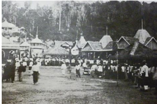
Photo 5. The Royal Wedding

As a result, the town was forgotten and at present, if nothing is being done to revive the town and its glorified history, the town will slowly be lost. There are countless stories about the town that still remain questionable especially details about the construction project, developments, events, total population, and the most important of all, the reason it was abandoned xix .