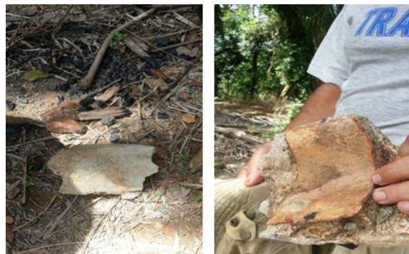
Photo 4. The remains of the palace roof

The question about Lubuk Pusing being abandoned was still unanswered. In the author's opinion, the Sultan's real intention was to build a base camp that could compete with Penang which was prosperous under the British rule because the town's location was facing the Muda River. Moreover, the Muda River used to be a maritime port hundred years ago xvi .