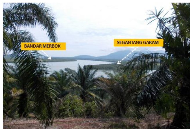
Photo 2. View from Lubuk Pusing

Based on the author's research, it is very likely that the lamp posts that the locals mentioned were actually telegraph posts which were installed in that area. The line was said to be installed from the river bank of a place called Segantang Garam . This place is said to be situated opposite Lubuk Pusing xiii (Photo 2). This fact is still being studied by PSMCK; however, based on the verbal sources collected from stories passed down from generation to generation, there were telegraph posts in the area. Basically, it makes sense because during that era, Kedah was the telegraphic equipment hub or depot for provinces in south Siam such as Salang (Phuket), Rundung (Ranong), Kupa (Takuapa), Pungah (Pangga), Gerbi (Krabi) Segenting Kra (Kra Buri) and also Terang xiv .