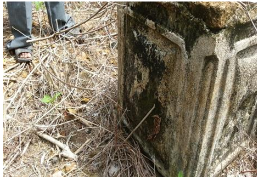
Photo 3. Pillar plate of the palace in Lubuk Pusing

It came as a surprise for the locals when the author showed photos of the town which used to be located in that area. The author has also managed to track several remains such as the pillar plate of the palace and the rest house, swimming pool, market area and the mosque's ablution pool. From the author's observation, the swimming pool was quite similar to the swimming pool found in an old palace in India. It could be that a builder from India was brought to Kedah for that purpose. This fact is not impossible because the construction of Kuala Kedah city was also sourced from Indian expertise and technology. In fact, in one of the pillar plates there was a fossil of snail shells which are believed to have been used to strengthen the construction. The same was also found in the construction of Kuala Kedah city which can still be seen until today xv .