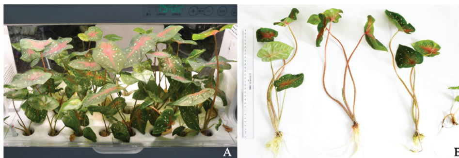
JG: Japan Garden formula; SCAU-B: South China Agriculture University formula B for leafy vegetables

Variance of physiological parameters related to plantlet growth and development treated by different hydroponic solutions was shown in Table 2. Results showed that the plantlets grown in SCAU-B yielded the highest content of chlorophyll a , chlorophyll b , total chlorophyll, carotenoid, soluble sugar and soluble protein after 30