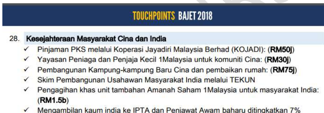
FIGURE 2. Touch Points 2018 Budget (Prime Minister's Office, 2017)

Furthermore, to develop Chinese New Villages, a total of RM65 million is provided, while another RM10 million for housing refurbishment programme. 19 and Figure 2 shown that development allocation for year 2018 is RM75,400,000 which mean that each Kampung Baru will have allocation approximately RM123,000.