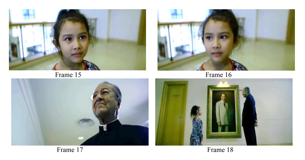
FIGURE 6. Return of a political icon

A total of four frames formed the conceptual roadmap on Tun Dr Mahathir through Aisyah at the art gallery. The four frames (i.e. Frame 15 to Frame 18) shown in Figure 6 are not scattered but are linked in sequence as in the short film.