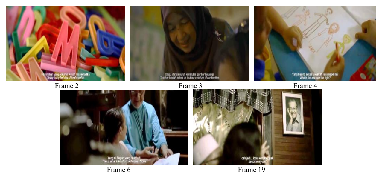
FIGURE 4. Popular prime minister across society

The images in Frame 2, 3, 4, 6 and 19 in Figure 4 consist of various ideas at different levels of society. All the five frames with still images and signs are analysed in consideration to the representation of Tun Dr Mahathir across society.