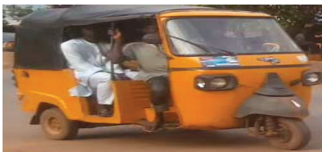
FIGURE 4. Showing awkward sitting postures of a passenger holding on to vertical supporting frames to maintain stability and resist tendency to fall out

All the above findings are at variation with those reported by Dike (2012) where the respective ratios of the users of Tricycle, Taxi and Bus attributing convenience to these means of commercial transportation were 6.3: 5.8: 1.0 representing 48.2, 44.1 and 7.6% of respondents respectively. Meanwhile, the respective ratios that attributed comfort were 1.3 (31.2%): 1.9 (44.7%): 1.0 (24.1%). This implies that according to the passengers, Tricycle is the most convenient but second in comfort among the three transport units.