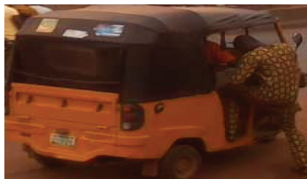
FIGURE 2. Showing a passenger in an extreme bending posture while entering the Tricycle

Tricycle, such as frame (as noted in Figure 4) and edge of the body (as observed in Figure 3). Nerves may be irritated resulting to pains in those regions of their body.