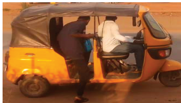
FIGURE 3. Showing awkward postures of user entering the Tricycle using his side