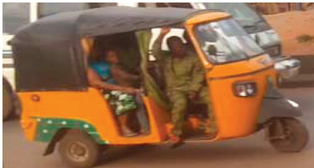
FIGURE 3. Showing the awkward sitting postures of a passenger holding on to roof horizontal supporting frames to keep himself in position and avoid falling out