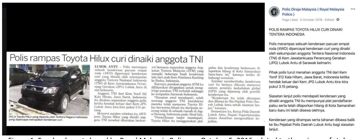
Figure 1: Facebook post shared by Royal Malaysia Police on October 5, 2016 related to the seizure of stolen Toyota Hilux driven by the Indonesian National Army in Lubuk Antu, Sarawak.