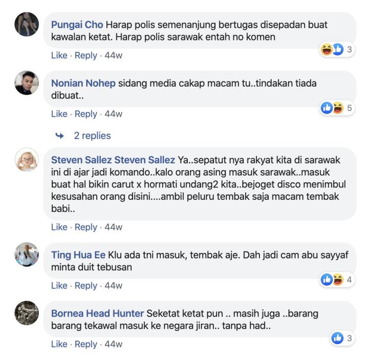
Figure 5: Original screenshot from Facebook comments related to Sarawak-Kalimantan border issues.

Another point that we found from our analysis is the push for reestablishment of the now-defunct Sarawak Rangers and Border Scouts in Sarawak to facilitate authorities in strengthening state borders. For example, one Internet user stated that reviving Sarawak Rangers and Border Scouts should be the top priority of the government as an effort to enhance border control mainly due to the upcoming relocation of Indonesian capital to East Kalimantan (see Figure 2).