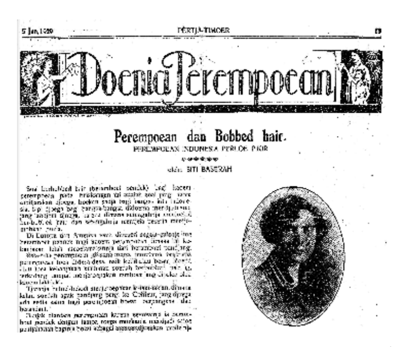
Picture 1: Article about short hairstyle in Pertja Timoer newspaper, Medan (1929)

During the 1920s, western civilized bodies were discussed in several newspapers. In 1920, Soeloeh Indonesia (Surabaya, Java) reported that western culture pressured Indonesian women through shortening hairstyle (Redaksi, 1926). In contrast, in Pertja Timoer newspaper (Picture 1), Siti Baserah wrote about a short hairstyle as the demands of the modern time. She suggested shortening the hair as a personal choice, "kesoekaan diri sendiri" (contentment of the self) (Baserah, 1929). In addition, many opinions have suggested individual bodily orientations, for example, the psychological body management (Istidjab, 1931). While, children were taught with individual etiquettes, such as brushing teeth and cleaning of the body in everyday life (Soegiarti, 1936).