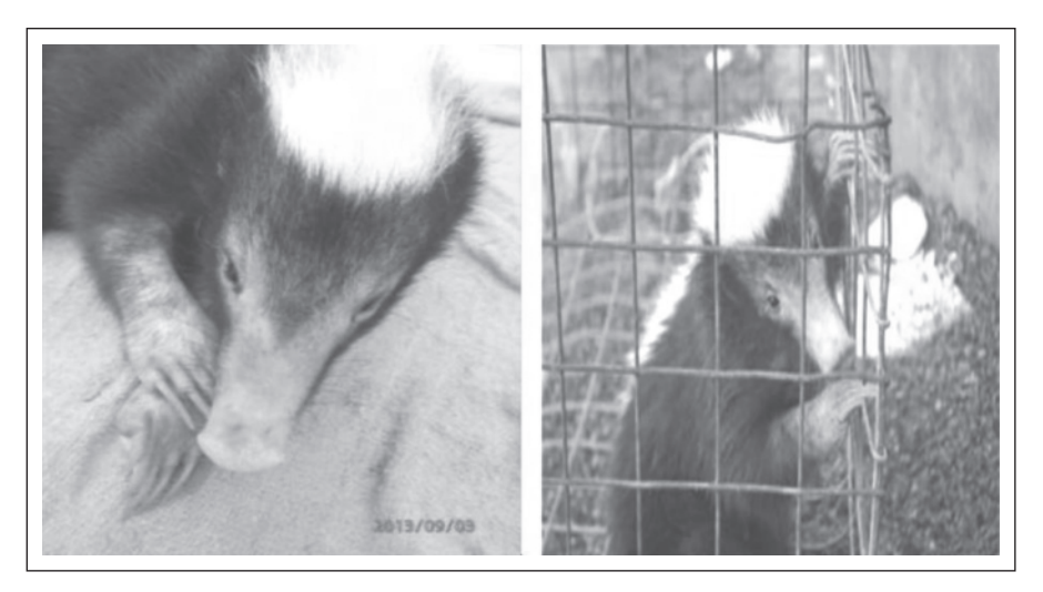
Fig. 1. Phenotypic appearance of Sarawak M. javanensis

(Dragoo and Honeycutt, 1997). Few studies are available to portray carnivores' phylogenetic relationships by including Mydaus as one of the taxa studied. However, the number of samples is limited, with few mitochondrial DNA (mtDNA) loci having been sequenced. Therefore, in this study, we include two mtDNA loci to determine the phylogenetic position of M. javanensis from Sarawak, Malaysia. Mitochondrial DNA (mtDNA) has been widely used to infer phylogenetic relationships of closely related in vertebrates due to its unique characteristics (Ang et al. , 2012; Md-Zain et al. , 2010; Rosli et al. , 2014; Md-Zain et al. , 2018; Abdul-Latiff et al. , 2019).