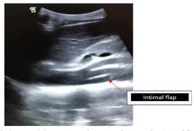
Figure 1: Bedside USG Abdomen in ED shows visualization of an intimal flap (red arrow)

The electrocardiogram (ECG) suggests of left ventricular hypertrophy. Initial bedside echocardiogram showed hypertrophic ventricles with dilated chambers, aortic root measured 3.0cm with no pericardial