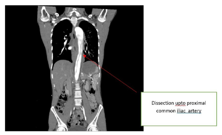
Figure 3: CT Abdomen coronal view