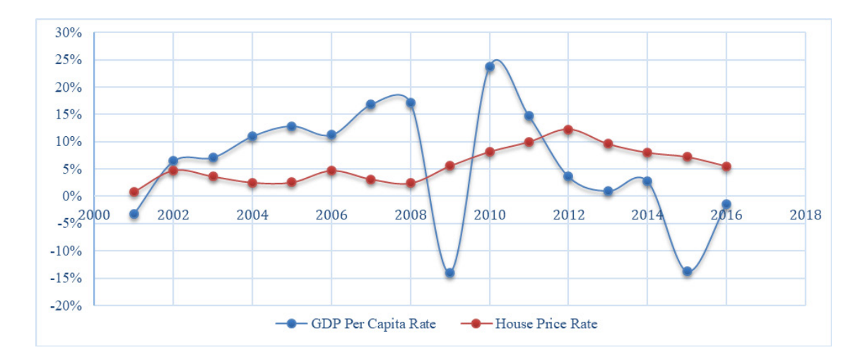
FIGURE 1. Comparison between gross domestic per capita growth and house price change rate