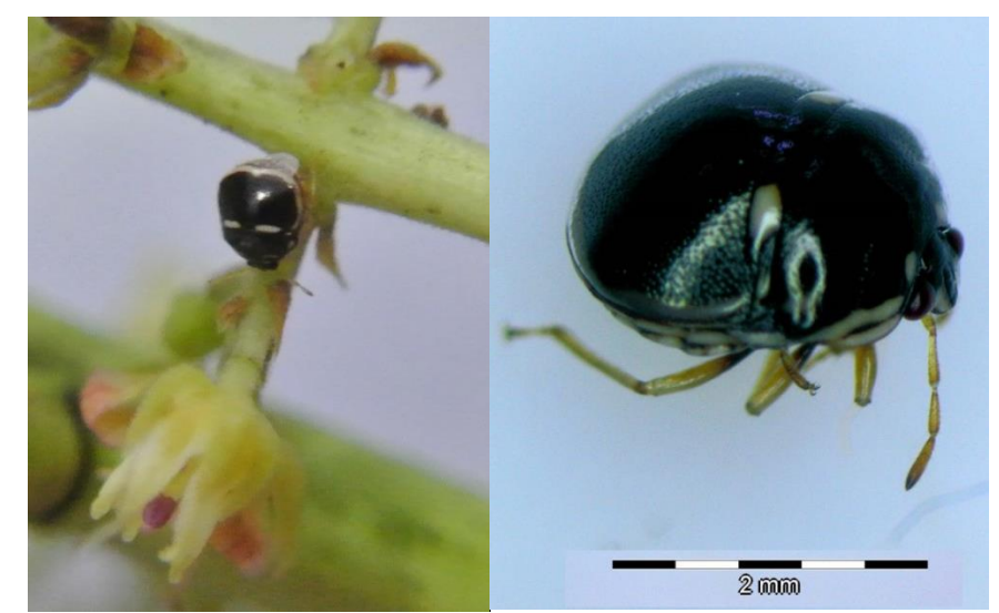
Figure 1. Adult of Coptosoma variegatum collected from mango panicle.

The abundance of C. variegatum recorded in control and treated plots were not significantly different in general. However, drastic increase in numbers of individuals in season 2 (Table 2) may resulted from successful establishment of this insect in control plot during season 1 as only single individual recorded in treated plot and others were found in control plot. This situation suggested that at the beginning of C. variegatum establishment in the orchard, abundant vegetation (weed) in control area are most likely provide stable and safer habitat for development of this insect compared to treated plot with application of herbicide. According to Candan et al. (2012), Coptosoma females deposit their eggs on leaves or stems of Fabaceae between 3 to 16 eggs per batch. Native legumes such as Centrosema pubescens and Calopogonium mucunoides which can be found around the orchard might become the host for development of these bugs but no detail study was done to support this statement.