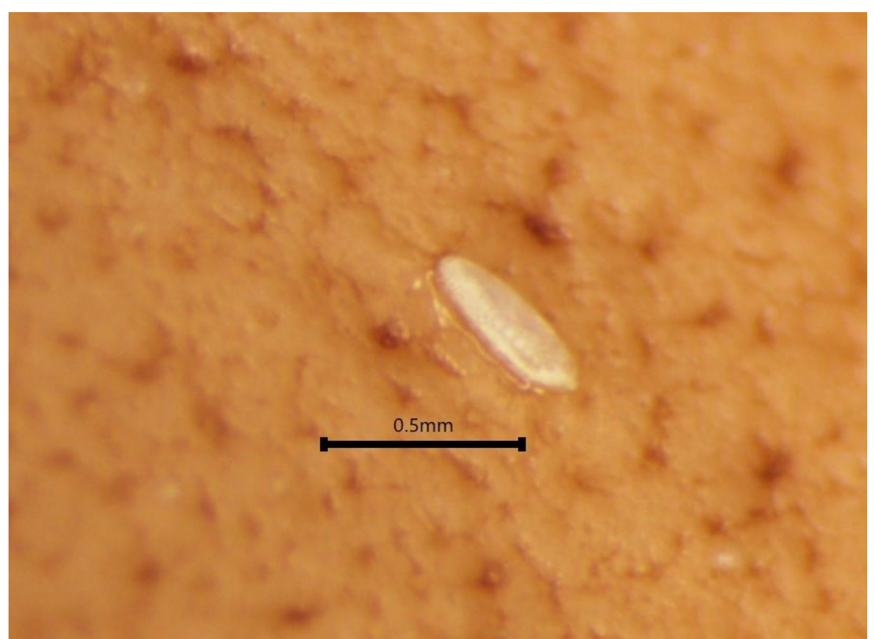
Figure 3. A phorid egg casing found on the outer surface of the cracked chicken egg.