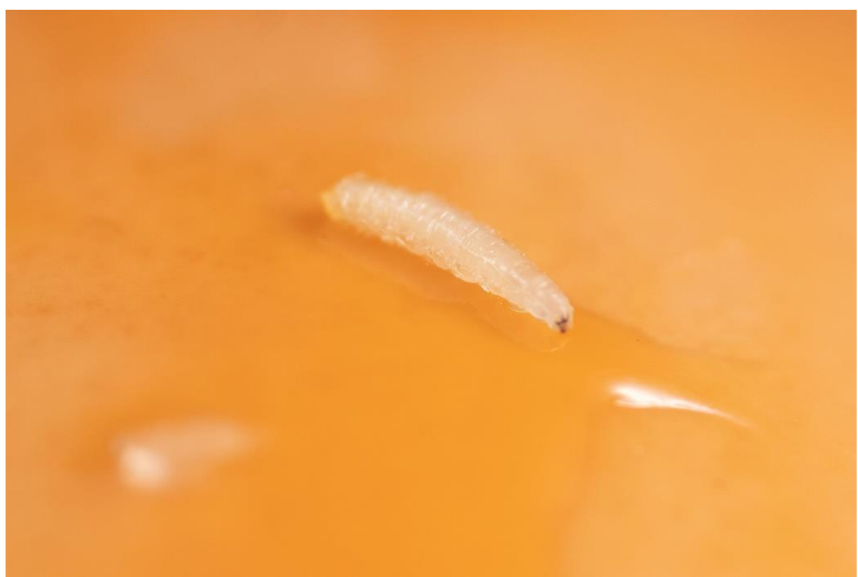
Figure 2. Post feeding larva on the outer surface of a cracked chicken egg.