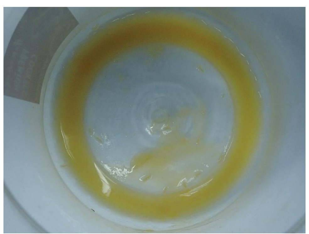
Figure 4. Phorid larvae that were observed feeding on the rotten egg.