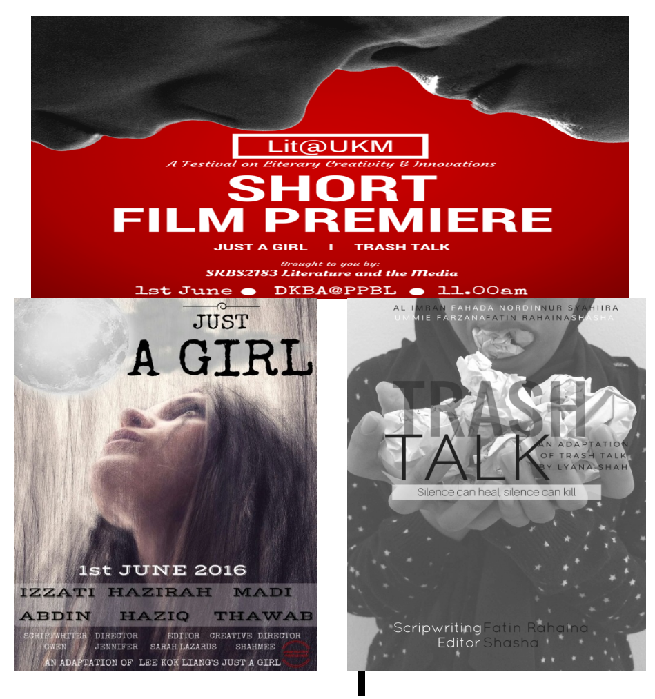
FIGURE 4. Short Film Premiere Publicity Posters