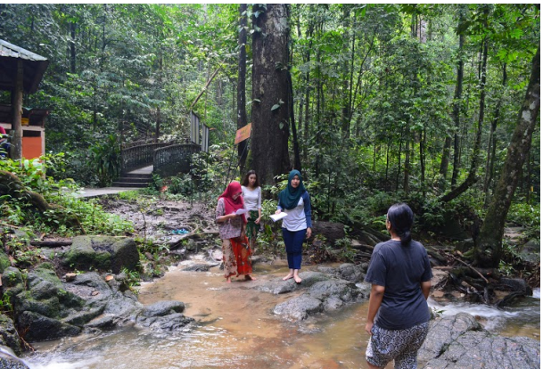
FIGURE 3. Short Film on- Location Film Shoot