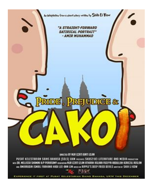
FIGURE 5. Short Films Posters

The images above show the posters produced by the students to publicize their short films. Drafts of the posters were earlier presented to their peers at the pitching session and selected as final version for the premiere. At the Short Film Premiere, groups introduce their films and screen their short film to an invited audience comprising of their friends, parents,