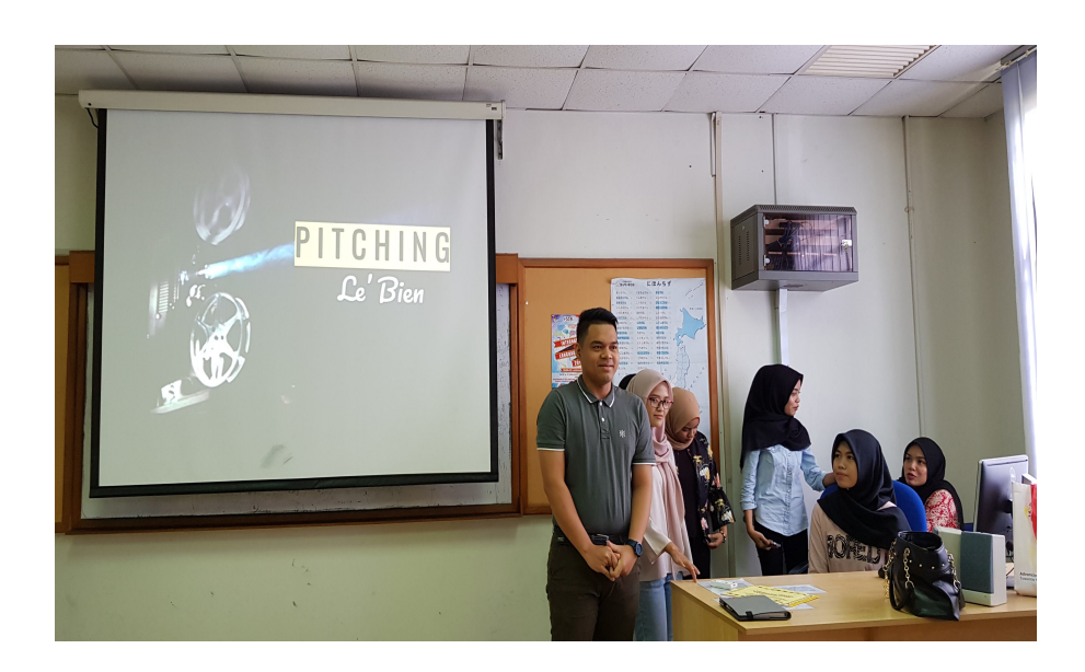
FIGURE 2. Pitching session by Literature and the Media Students

design and even different climax options to their peers and lecturers and use the feedback to change or further improve their short film.