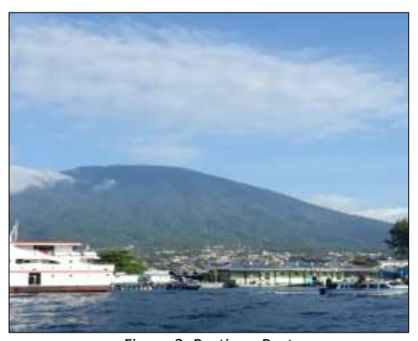
Figure 3: Bastiong Port

The kingdom of Ternate played an important role in the North Maluku region until the 17th century. In the historical records of the Sultanate of Ternate or also defended with the Kingdom of Gapi, is one of the oldest and very influential kingdoms in the archipelago. Ternate has been visited by foreign traders such as those from China, Arabia and Gujarat, as well as those from the archipelago such as Java, Malacca, and Makassar. Ternate developed into the largest and main trading port in Maluku. Trade between nations at that time was centered at the port of Talangame, currently known as the port of Bastiong. Ternate already has a market with adequate facilities, where local traders, foreign traders and domestic traders meet (Rusdiyanto, 2018).