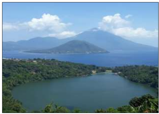
Figure 2: Scenery of Fhitu, Ternate

According to the Ternate City Development Planning Agency (BAPPEDA) (2012), the city of Ternate is located between 3 degrees Northern Latitude and 3 degrees Southern Latitude and 124 - 129 degrees Eastern Longitude. Ternate City borders the Maluku Sea in the north, south and west, and the Halmahera Strait in the east. As an Island City, Ternate consists of 8 (eight) islands, namely: five inhabited islands of Ternate as the main island, Hiri, Moti, Mayau, and Tifure, and three small uninhabited islands of Maka, Mano and Gurida. The territory of Ternate City covers 5,795.4 km², consisting of 5,544.55 km² of waters and 250.85 km² of land.