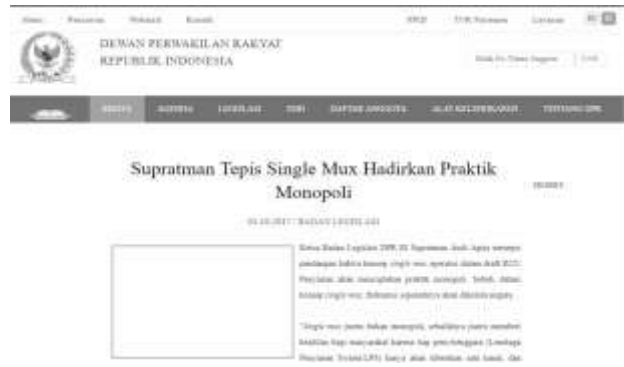
Figure 4: Information Release of Badan Legislasi DPR, October 3, 2017

That, since October 3, 2017, in the Legislative Body's news, on the official website of the parliament http://www.dpr.go.id/, Chairman of the Legislative Body of the Republic of Indonesia Supratman Andi Agatas, dismissed the view that the concept of the single-mux operator in the draft bill Broadcasting will create monopolistic practices. Because, in the concept of single-mux, the frequency will be fully managed by the state.