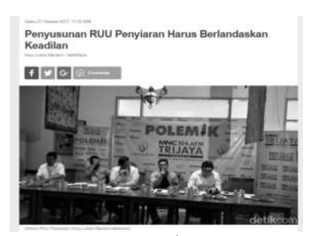
Figure 3: Detik.com News

In the content, it is narrated that single-mux has the potential to present a monopoly in the broadcast industry. In the concept of value-framing, reporting usually describes a policy debate as a clash of moral principles or basic values, with disputing parties and conflicting based on a certain set of values. Here, detik.com tries to present information, that it is as if the single-mux policy violates the values of justice, intending to strengthen sympathy for the opposite policy (multi-mux). This information is packaged, only from one perspective, where other perspectives are not included in the framing of the news.