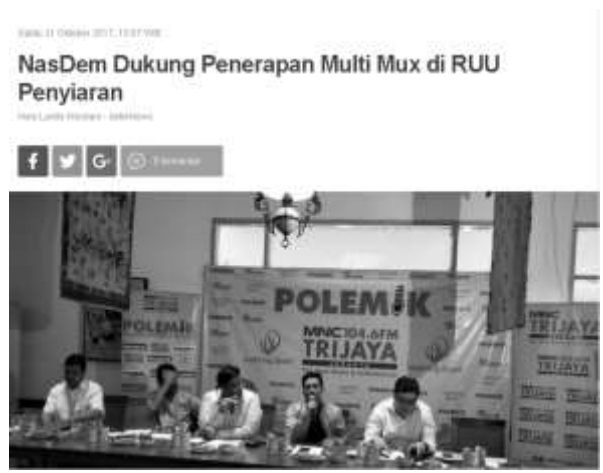
Figure 6: Detik.com News at Oktober 21/2017

The Nasional Demokrat Party (Nasdem) faction is part of the legislative party, however, in practice, the Nasdem party has links to the private broadcasting industry, where its general chairman, Surya Paloh, is one of the owners of Media Indonesia Group, one of the broadcasting companies that are directly interested with the policy agenda being discussed. The selection of subjects in the news content above actually originated from several related parties written in the detik.com to support of their arguments, unfortunately, they only use subjects that have the same interests and negate discussions related to the public interest.