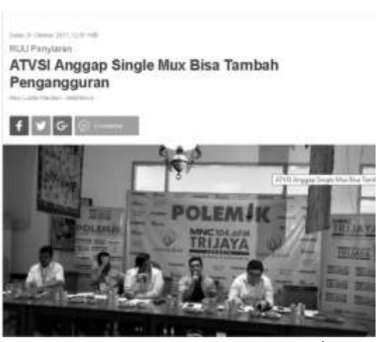
Figure 5: Detik.com News at October 21/2017

In the process of determining the policy agenda, the DPR, the Government and related parties are both a preference in the decision-making process. When the media reports information in a balanced presentation, it means that the media carries out its task in educating the public about the value of the policy agenda. Conversely, when information comes only from the preferences of one particular party, automatically selects information based on reporting needs. As an example: