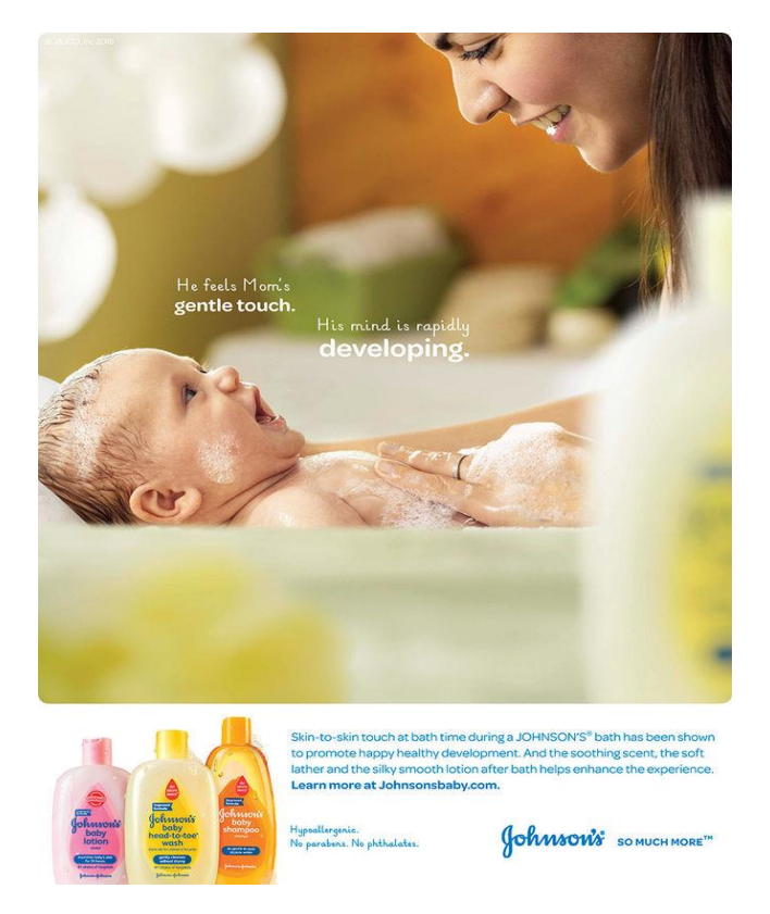
Ad. 2. Baby Shampoo by Johnson's