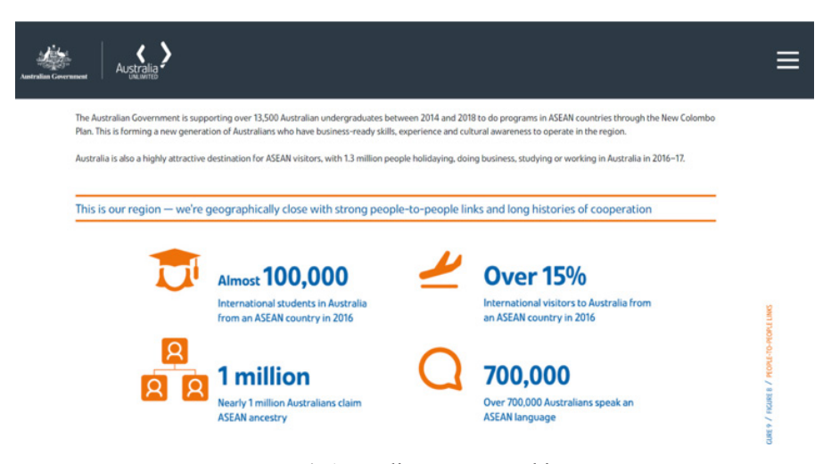
FIGURE 4. Australian Demographic Data

many Australian students to skip ASEAN as the destination of choice due to preconceive idea of ASEAN and what it can offer. The lack of interest for the Australian student from these backgrounds to come to ASEAN can also be contributed to the type of mobility programme offered. A short term niched based programme to ASEAN is more likely to gain response in comparison to a full semester exchange program.