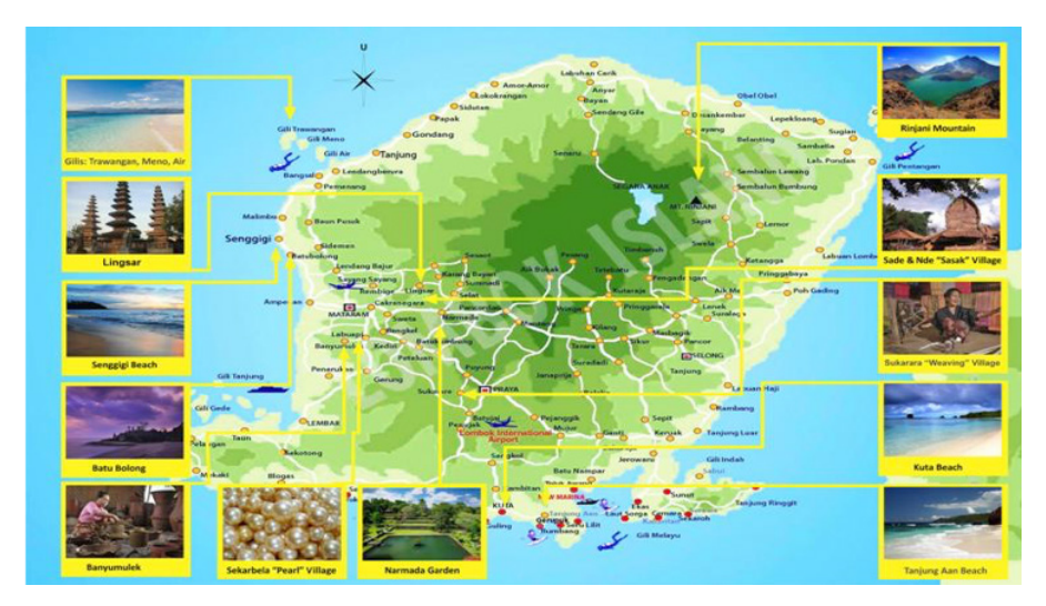
Tourism Map of Lombok Island

Tourism activities that can be done in Gili Trawangan based on the land use regulations written in Governor Decree NTB No. 500 in 1992 are swimming, boating, sailing, wind surfing, game fishing, water skiing, diving, snorkelling, agro-tourism (pearl cultivation), and touring around the Island with cidomo. Most of the tourists coming to Gili Trawangan are domestic and foreign tourists for sight seeing and recreational purposes.