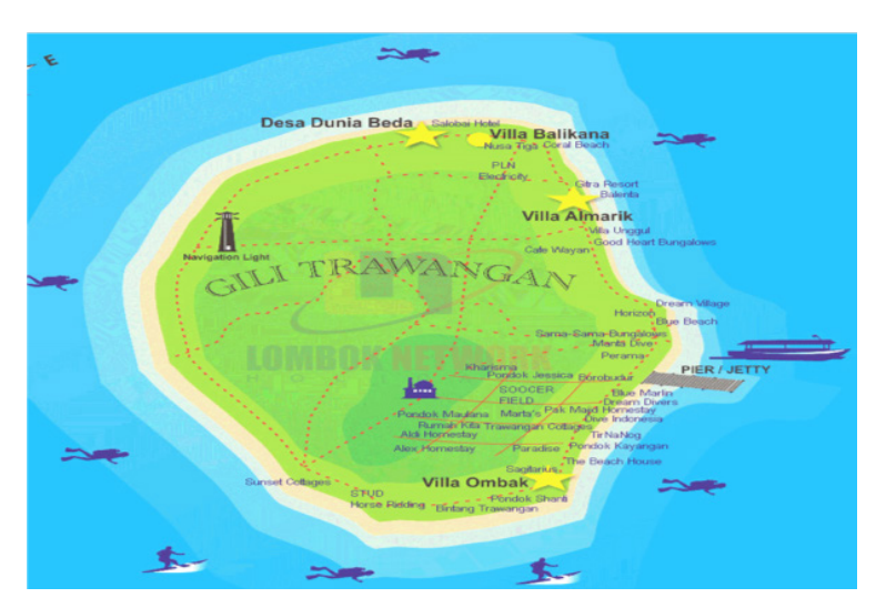
Gili Trawangan Island, North Lombok

The total number of population in Gili Indah Village is 5, 113 people, spread in three backwoods with total neighborhood association (RT) of 17 and total chiefs of households of 1333. The population is made up of 3.064 males and 2.049 female.