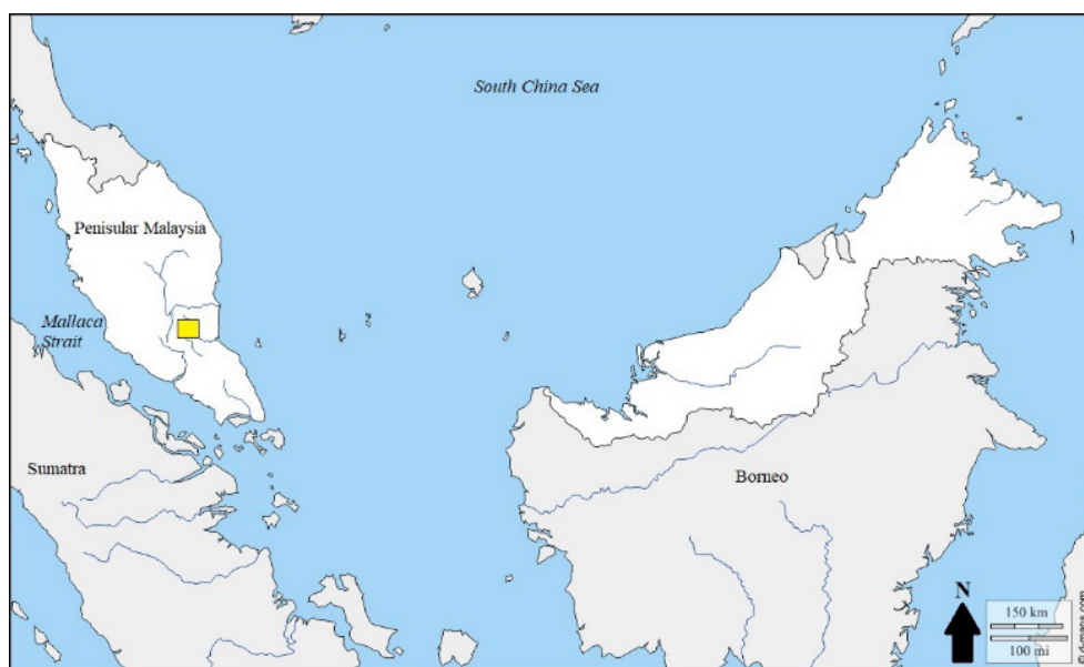
FIGURE 2. Location of C. leucas (yellow square) found in Sungai Mawai Lama, Kota Tinggi District, Johor, Peninsular Malaysia