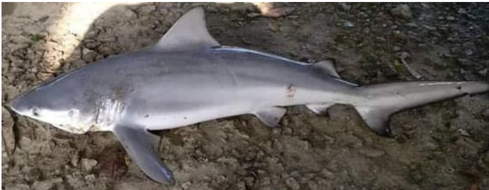
FIGURE 1. Carcharhinus leucas , Sungai Mawai Lama, Kota Tinggi District, Johor, Peninsular Malaysia

A single specimen of a sub-adult C. leucas with c. 102 cm of total length (Figure 1) was landed and photographed on 25 March 2019 in Sungai Mawai Lama, Kota Tinggi District, Johor, Peninsular Malaysia (1°52'18"N; 103°57'13"E) (Figure 2). Sungai Mawai Lama is tributary to the larger Sungai Sedili Besar which drains into the South China Sea. The site of the capture is in inland Peninsular Malaysia at a freshwater habitat located in c. 25 km distance from the estuary. This specimen was collected by a local fisherman using medium sized hook. Photo material of this specimen was submitted to the first author for examination. Diagnostic morphological characters of the single specimen were analyzed under consideration of the methods by Compagno (1998) and Ebert et al. (2013) (Figure 3).