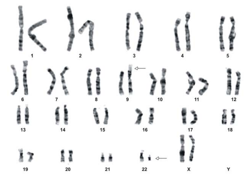
FIGURE 3: Giemsa-banded chromosomes showing karyotype of patient's (Case 9) mother with translocation between the long arm of chromosome 22 and the short arm of chromosome 9 (arrows).

done on this case using FISH showed deletion on the locus responsible for DGS (figure 2).