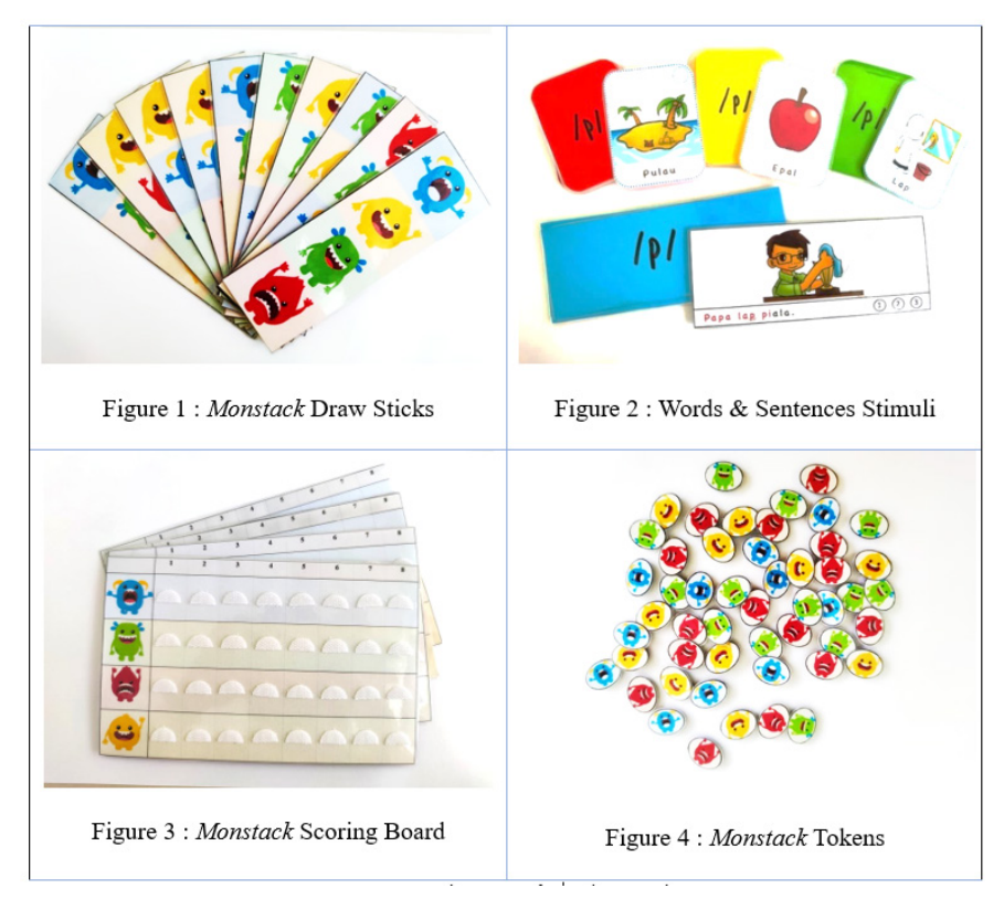
FIGURE 1-4. The Monstack Board Game Kit