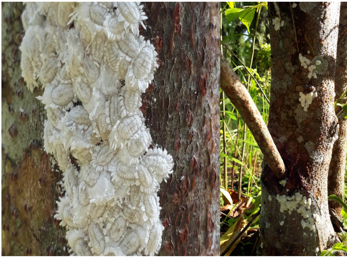
Figure 1. Nymphs and adults of Rastrococcus tropicasiaticus Williams on a tree of Azadirachta excelsa (Meliaceae)

The morphology of R. tropicasiaticus is very close to R. biggeri , described from the Solomon Islands, in possessing marginal multilocular disc pores on the venter of the head, thorax and abdomen, and dorsal large-type quinquelocular pores (Williams 2004). However, in R. biggeri the multilocular disc pores are numerous on the head and thorax, and extend in a zone to the margins whilst in R. tropicasiaticus the marginal multilocular disc pores are few. The species is also similar to R. jabadiu by having large-type quinquelocular pores on the dorsum but they can be easily differentiated by the presence of multilocular disc pores on the ventral margin of the thorax (Figures 2a-c).