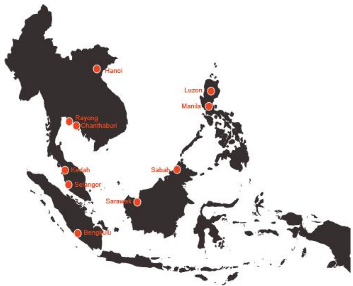
Figure 3. Updated distribution of Rastrococcus tropicasiaticus Williams in Southeast Asia (after García et al. 2016).