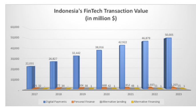
FIGURE 2. Fintech Transaction Value in Indonesia

Furthermore, Abdillah (2019) added that there are 4 (four) types of Fintech transactions that are developing in Indonesia, namely digital payments, personal finance, alternative lending, and alternative financing. Digital payments had become the highest transaction value by 18.20% growth during 2017 – 2021 and predicted growth by 7.94% for the next two years. Meanwhile, alternative lending had grown by 10.71% during 2017 – 2021 and is predicted still have room to grow by 7.05% until 2023.