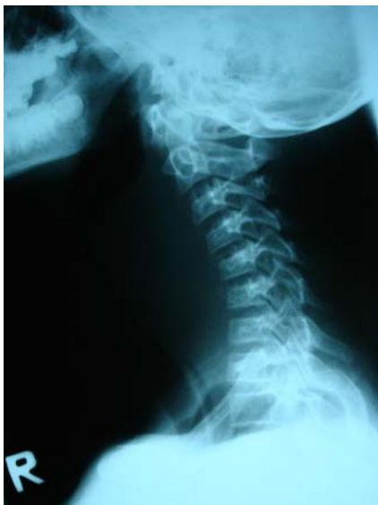
Figure 1: Lateral neck X – ray demonstrating increase prevertebral soft tissue space and loss of lordosis of cervical spine.