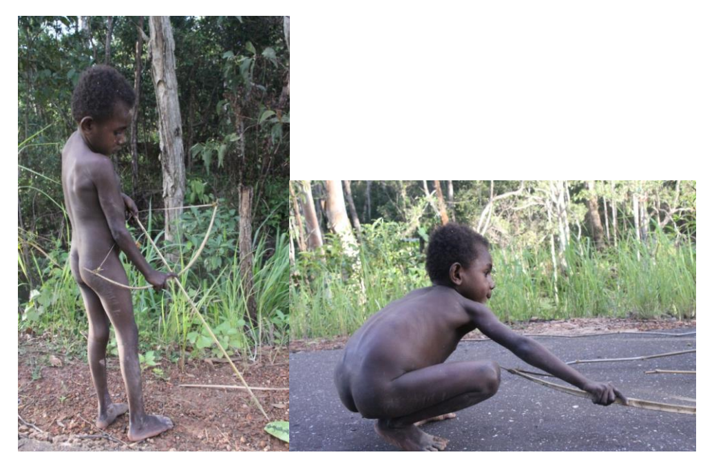
Photo1: Stage 1 and 2 of playing kiri mbal-bal (Doc. SM)

The games start from the beginning to the end kumbili harvest, which is held in March in Yanggandur village. Photo 1 and photo 2 show a child playing kiri mbal-bal .