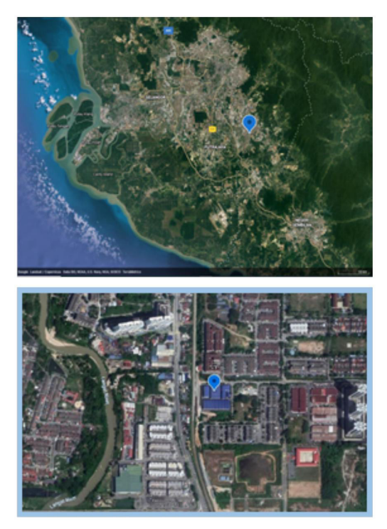
FIGURE 1. Sampling location

The wastewater sample was collected from both influent and effluent chambers of the sewage treatment plant (STP) design with a population equivalent (PE) of 150,000 and a daily flow of 33,750 m3/day. The nature of water treated in this STP is domestic and from commercial areas shown in Figure 1.