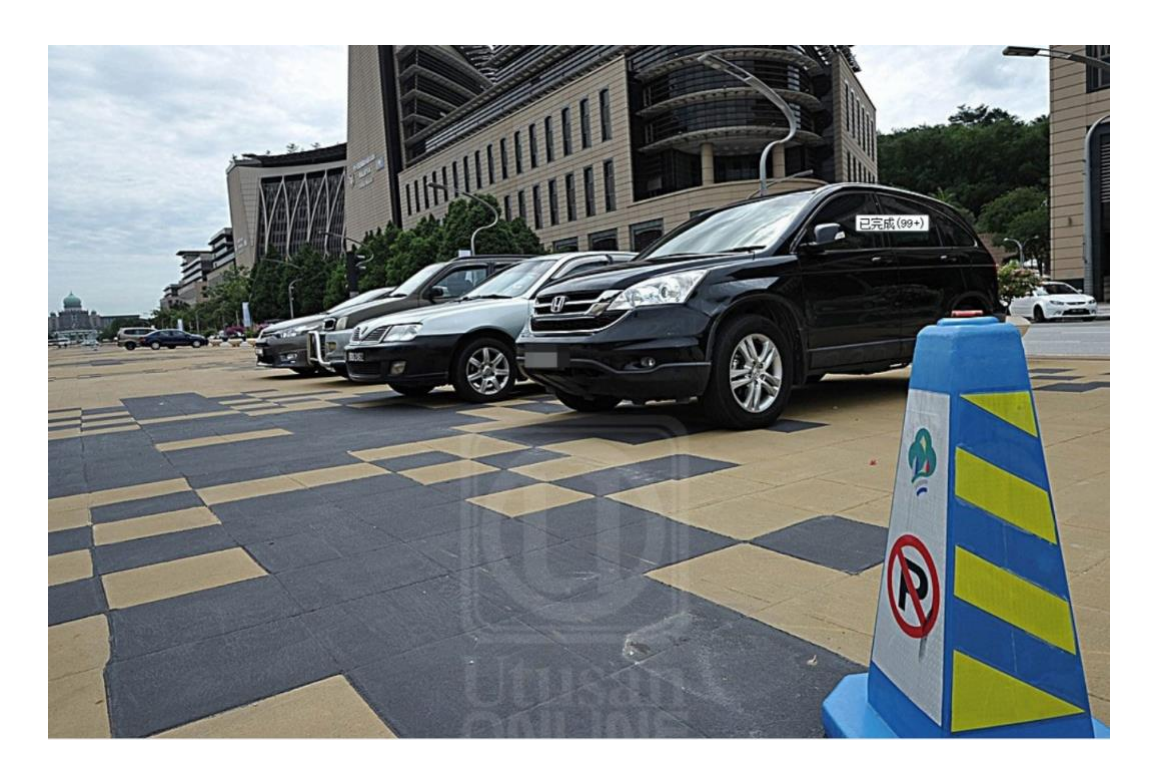
Figure 1. Traffic cone was place to remind driver does not park their vehicle at the road centre to avoid traffic congestion.

The problem of parking congestion at the Federal Government Administrative Center, Putrajaya is just as bad as it is. The officer and visitors have to travel for hours searching for parking lots. The lack of chronic parking also poses many other problems such as traffic jam, and also prevents garbage truck passage for collection works (Baharuddin & Kamarudin, 2016).