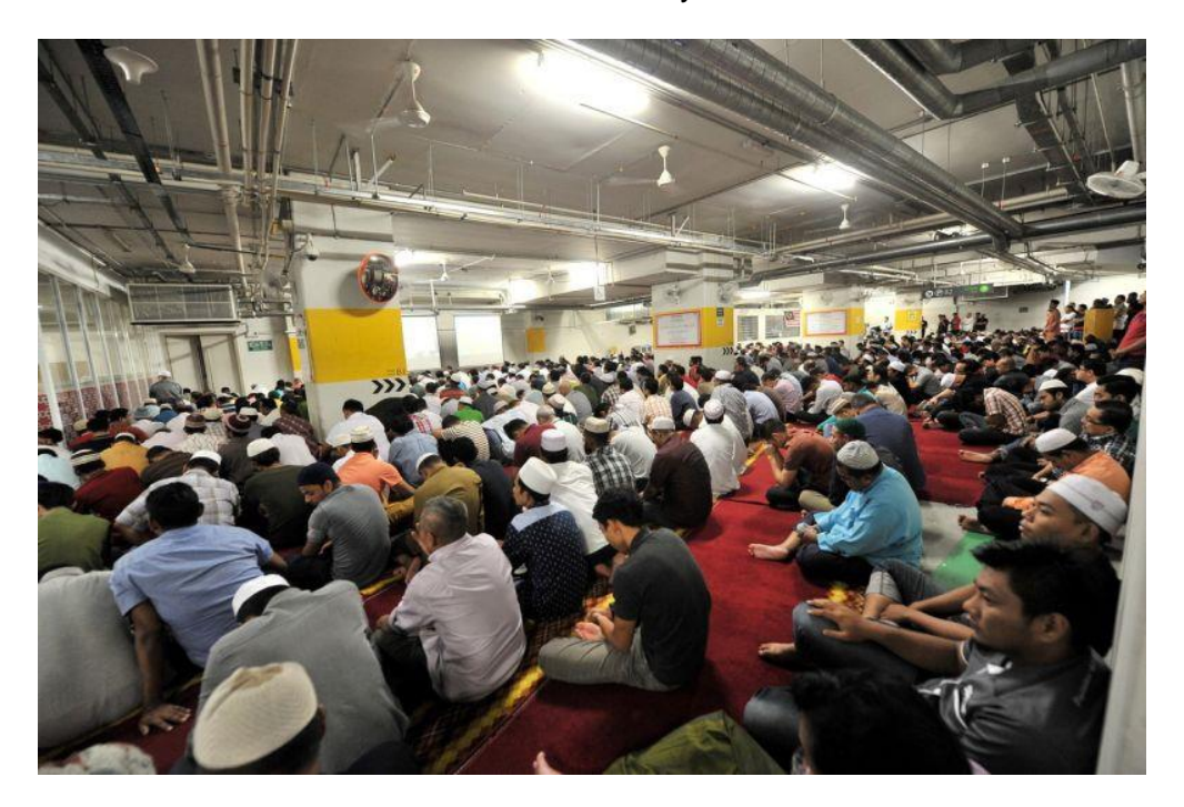
Figure 5. Surau Wakaf Dawjee Dadhaboy at Menara Bank Islam

Surau Wakaf Dawjee Dadhaboy at Menara Bank Islam is a Friday Surau that able to accommodate 3500 at one time. This surau, which starts as a small surau that can accommodate about 600 people, is now able to accommodate Friday congregation up to 3,500 people (Setiap Jumaat, tempat letak kereta bertukar surau wakaf, 2016).