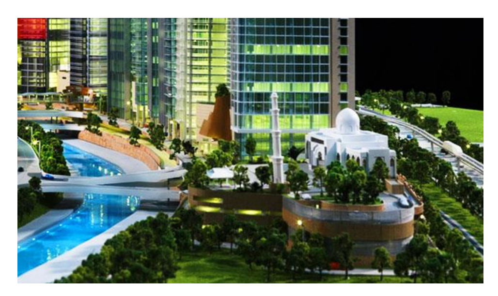
Figure 4. Masjid Jamek Abdullah Hukum (Source: Mosque above parking lot to be opened on July 31, 2016)

Masjid Jamek Abdullah Hukum is a mosque on top of a parking lot in Kuala Lumpur, Eco City.