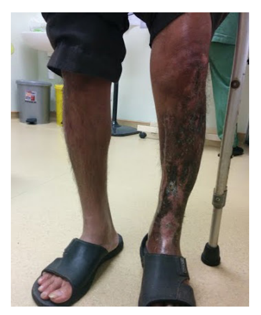
Figure 5: Clinical picture of the patient after the successful limb salvage surgery.

Debridement and immediate muscle flaps coverage are the primary surgical strategies to provide effective treatment of chronic osteomyelitis and ultimately successful limb salvage surgery (Figure 5).