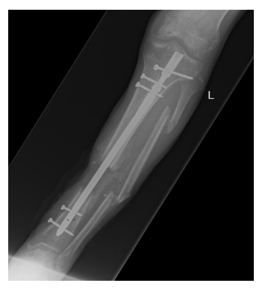
Figure 3: Tibia/fibula X-ray (AP), showing intramedullary nail inserted to stabilize the bone with a bridging callus and involucrum.

Removal of the old external fixation and insertion of new external fixation was done with insertion of gentamicin impregnated beads (Figure 2).