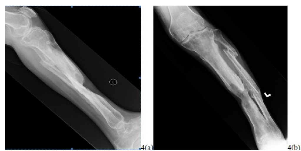
Figure 4: Lateral 4(a) and anteroposterior 4(b) X-ray showing new bone formation at the dipahyseal region with consolidation.

intravenous antimicrobial therapy dated from the last major debridement (Cierny et. al. 2003). At this point, if adequate debridement not done, it will cause failure of treatment despite prolonged antibiotic use. Dead space management is also essential to halt disease progression apart from maintaining bone's integrity. The objective is to replace dead bone with durable vascularized tissue which in this case was Genexosteoconductive synthetic bone graft.