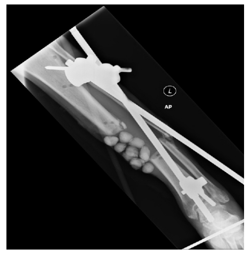
Figure 2: Tibia/fibula X-ray (AP), showing post wound debridement, sequestrectomy and insertion of gentamicin impregnated beads.

A 44-year-old male was involved in a motor-vehicle accident and sustained an open fracture grade 3 mid shaft left tibia and segmental fracture left fibula on 13.3.2010. He had undergone initial wound debridement and external fixation. He presented to us 4 months later with an infected wound at the donor split skin graft site and non-union of mid shaft left tibia with features of osteomyelitis at pin site.