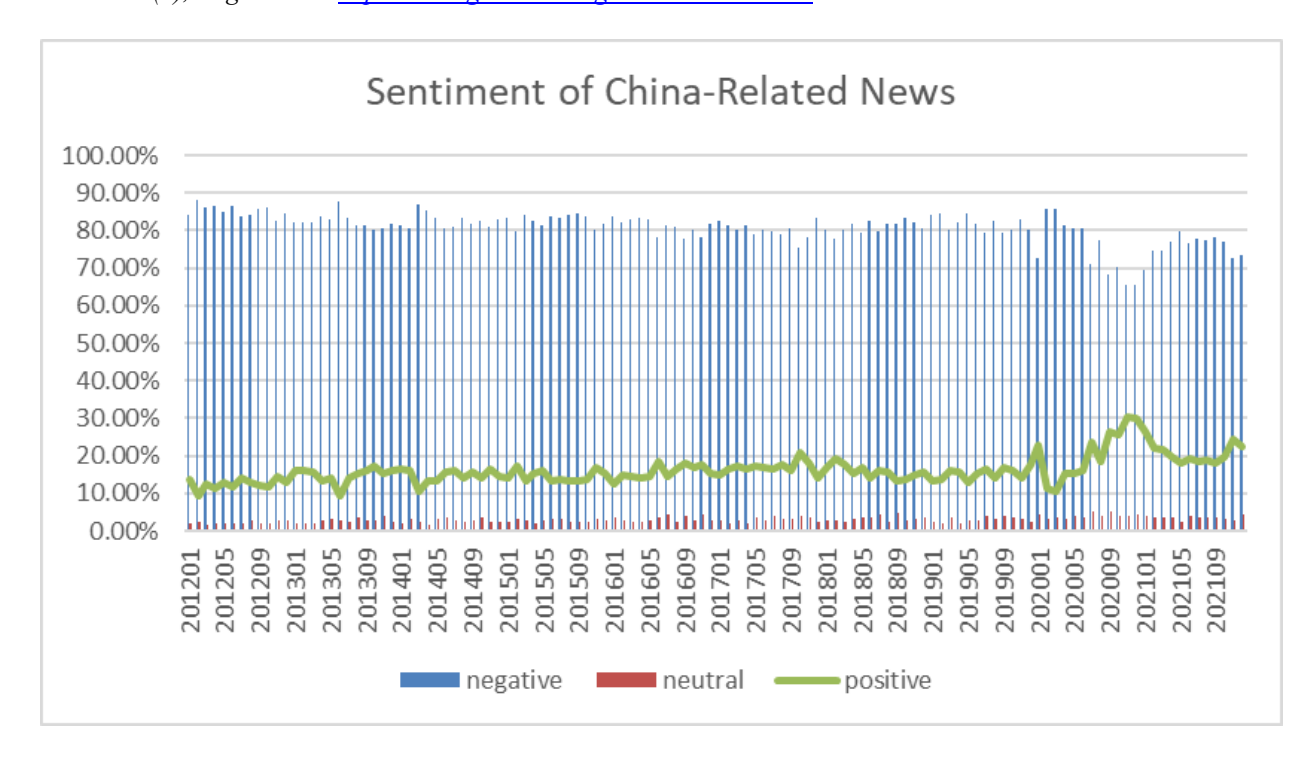
FIGURE 2. Sentiment of China-Related News (in percentage)