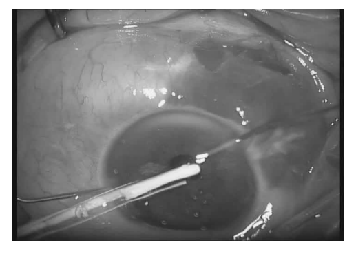
Figure 2: Removal of intracameral Ozurdex® via boat-shaped 24-gauge cannula tip

The tip of the 24-gauge plastic sleeve cannula was reshaped. The superior half of the tip was cut off resembling a 'boat' shape to fit in the Ozurdex® during the process of removal (Figure 1). Viscoelastic was then injected into the anterior chamber. The modified silicone tip of the cannula was inserted into the anterior chamber via the 3 o'clock paracentesis wound underneath the Ozurdex®. At the same time, an viscoelastic cannula was inserted through the opposite 9 o'clock limbal wound. Viscoelastic was further injected around the Ozurdex® to assist the placement of the Ozurdex® deep inside the modified 'boat' shaped cannula tip. The cannula was slowly retracted out from the anterior chamber while the viscoelastic was injected slowly over the Ozurdex® to secure it within the cannula tip (Figure 2). The entire procedure took less than 5 minutes with no gross residual Ozurdex® seen left in the anterior chamber. Complete removal of the viscoelastic was done at the end of the procedure. The paralimbal wound was then hydrated with balanced salt solution and was water