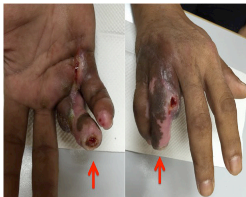
Figure 6: Post-revascularisation at 4 months: Fingers are pink with some hypopigmented region. Serous discharge seen from part of the wound.

We were not able to anastomose the other two digital arteries. The digital veins were not repaired due to time constraint and the presence of the skin bridge.