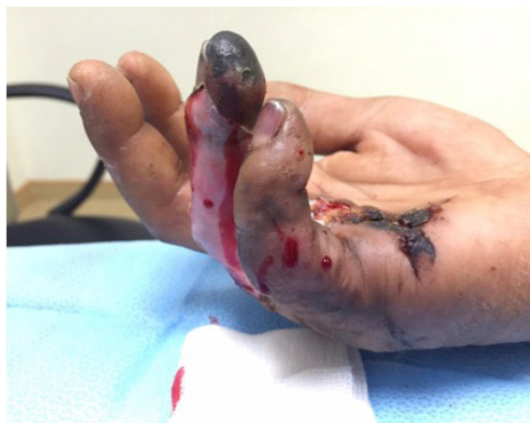
Figure 5: Post-revascularisation at 16 days: (View from the ulnar aspect). The skin of the ring and middle fingers have revascularised and turned pink