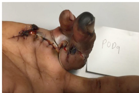
Figure 4: Post-revascularisation at 9 days: (View from the radial aspect) The skin was wet, macerated, discoloured and appeared unhealthy