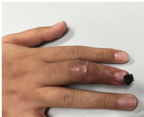
Figure 2: Post-revascularisation at 7 weeks: The skin has turned into a normal pink colour with just a tip of necrotic tissue

The condition of middle finger of the patient actually slowly improved every week. At 7 weeks post-operative, we were delighted to see new pink skin as the black, dry skin had desloughed off (Figure 2). At 3 years follow-up, he had excellent function and cosmetically good outcome. Nevertheless the finger was shorter than normal and sensation was reduced at 2/10. Motion was also reduced with 0-45 degree active motion at the proximal interphalangeal joint and a fused distal interphalangeal joint (Figure 3).