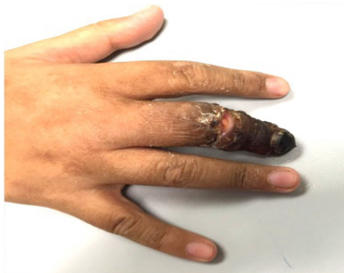
Figure 1: Post-revascularisation at 7 days: The skin of the middle finger remained black from the proximal interphalangeal joint to the tip