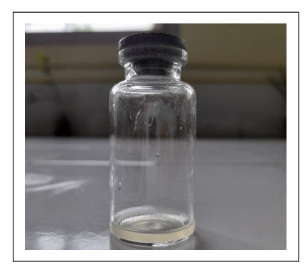
Fig. 1. The ovarian extract of Singkarak Lake pufferfish (T. leiurus).

The ovarian extract of Singkarak Lake pufferfish ( T. leiurus ) in Figure 1 is a crude extract, extracted using methanol mixed with 1% acetic acid. The characteristics of the ovarian extract are clear white color, no precipitate formed, odorless and tasteless. According to Kosker et al. (2016), the toxin in pufferfish is very polar and dissolves in methanol and acidic environments, and is tasteless, odorless, and colorless. Chen et al. (2012), also explain that crude extract can be used for cancer chemoprevention. It states that natural compounds regardless of crude extracts or isolated active compounds had drawn growing attention as an agent in cancer therapy and chemoprevention due to their ability to modulate apoptosis.