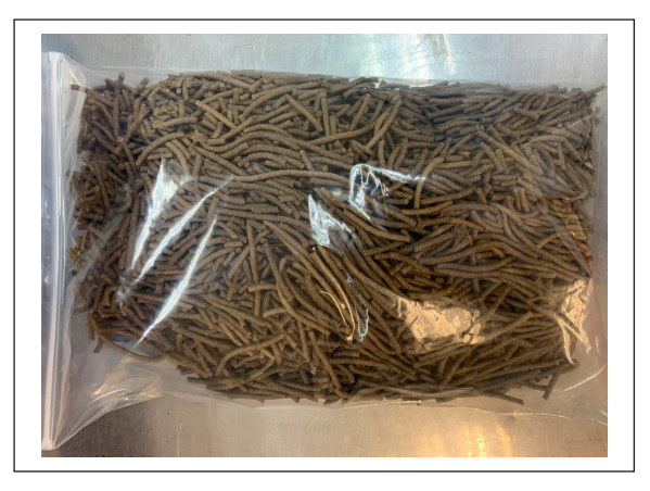
Fig. 1. Experimental feed formulated based on anchovy by-products

levels can be achieved when using ABP as a major ingredient.