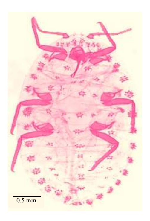
Figure 1. Coccidohystrix insolita , slide-mounted adult female

abdomen only; cerarii on margin numbering 17 pairs, each consisting of conical setae on a sclerotized prominence (but no trilocular pores); additional cerarii present on dorsal mid-line and submedial areas; and between medial and submedial cerarii on meso- and metathorax. Hind legs without translucent pores, each claw with a denticle. Circulus absent. Anal lobes present, each with a ventral sclerotized bar. Venter with quinquelocular pores numerous; multilocular disc pores numerous on abdominal segments III-IX; oral collar tubular ducts present on abdominal segments V-VIII; oral rim ducts absent.