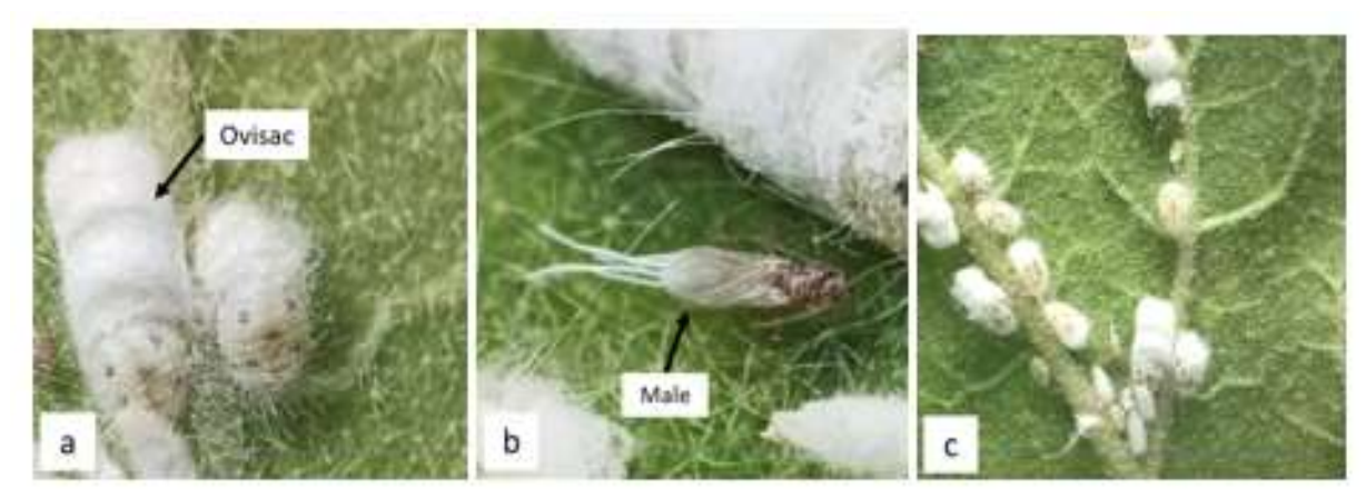
Figure 3. Coccidohystrix insolita on Solanum torvum leaf undersides: (a) live adult females with ovisacs; (b) live adult male; (c) a colony

Appearance of the adult female of C. insolita in life: body oval, almost glossy yellowish-green, with a very thin mealy wax coating especially on the dorsum; body 3-4 mm long, with a white waxy ovisac as long as or longer than the body formed at the posterior end from elongate white wax filaments (Figure 3a). Figure 3b shows the adult male of C. insolita in life, and Figure 3c shows a colony of the live mealybugs. The live adult female has several dark grey marks on the dorsum of the abdomen and thorax.