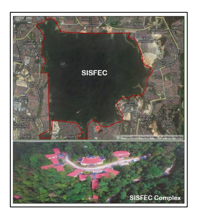
Figure 2: Location of study area