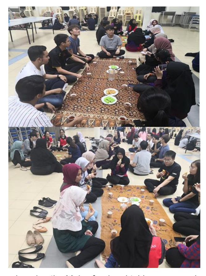
Figure 3: Students undergoing the Malay food and table manners simulation. The kuih and hot drink are served in plates and laid on saprah. Men and women are eating while sitting on the floor in the bersila and bersimpuh positions respectively.

group were asked to bring food and drink, as well as other utensils and equipment, to their respective groups. Before the simulation began, the instructor briefed the students on the following Malay table manners (Figure 3): 1) Laying off saprah on the floor where food and drink are served on it; 2) Manner of seating on the floor; men should criss cross their feet in front of them – bersila , while women should fold both their feet on one side – bersimpuh (normally on their right side); 3) Serving the food in the plate; 4) Wash hands before and after meals; 5) Reciting the prayer – doa makan before meals; 6) Invite the more senior ones to start eating first and prioritise them to help himself/herself first to show respect; 7) Use the right hand to eat, take and pass food to others; 8) Eat slowly and avoid chewing food loudly; 9) Manner of drinking; sip hot drink slowly and do not blow into the cup; 10) Clean and tidy up the eating area after meal (normally by the women). The non-Malay students were encouraged to imitate their Malay peers in the group during the simulation. Students were also encouraged to ask questions and share their own experiences.