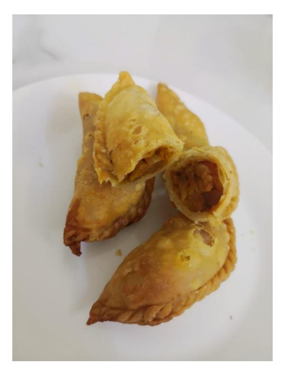
Figure 1: Kuih karipap

the start of the simulation activity at the cooking laboratory.