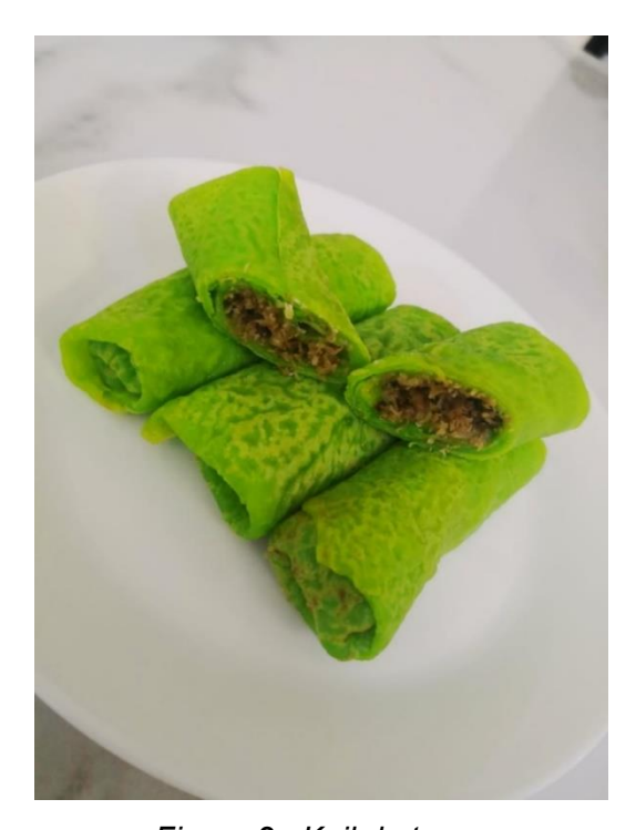
Figure 2: Kuih ketayap