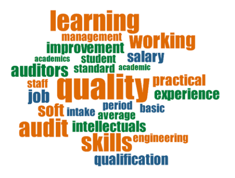
FIGURE 3. 25 most frequently occurring words out of the 369 words detected

in Malaysia Figure 3 displays the Word Cloud generated from the respondents' answers (after excluding essential words such as connecting words, pronouns, and so on). The words that make up the Word Cloud in Figure 3 are the 25 most frequently occurring words out of the 369 words detected.