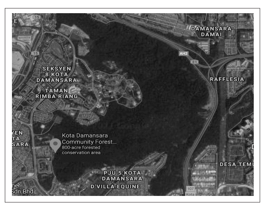
Fig. 1. Google map of Kota Damansara Forest Reserve in Petaling Jaya, Selangor.

of Kota Damansara Forest Reserve, Selangor. Ecological indices of the Shannon-Weiner Diversity Index (Spellerberg & Fedor, 2003), Evenness Index (Pielou, 1966), and Margalef's Richness Index (Magurran, 1988) were used to compute the species diversity and species richness of the study area using Paleontological Statistic Software Package for Education and Data Analysis (PAST) Software version 2.17c (Hammer et al., 2001). Total tree biomass was estimated by summing up above-ground biomass (AGB) (Kato et al., 1978) and below-ground biomass (BGB) (Niiyama et al., 2010), respectively. As for determining the soil-vegetation relationships, ordination methods were conducted in the software CANOCO version 5.0. Preliminary analysis of detrended correspondence analysis (DCA) indicated the appropriateness of redundancy analysis (RDA) to be used in this study (Ter Braak & Smilauer, 2015).