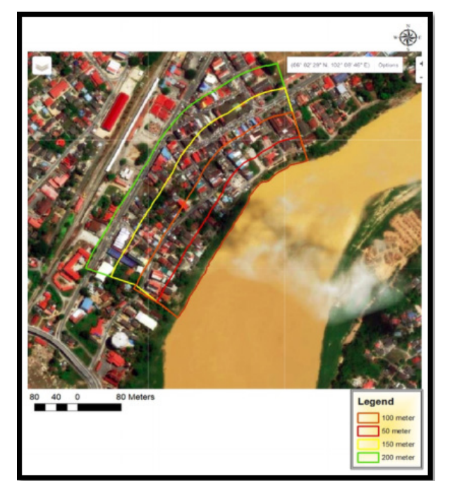
FIGURE 3. Affected Area

The ArcGIS was used to perform a buffer analysis of the research location to identify the zone in the real situation with the DID-established zone