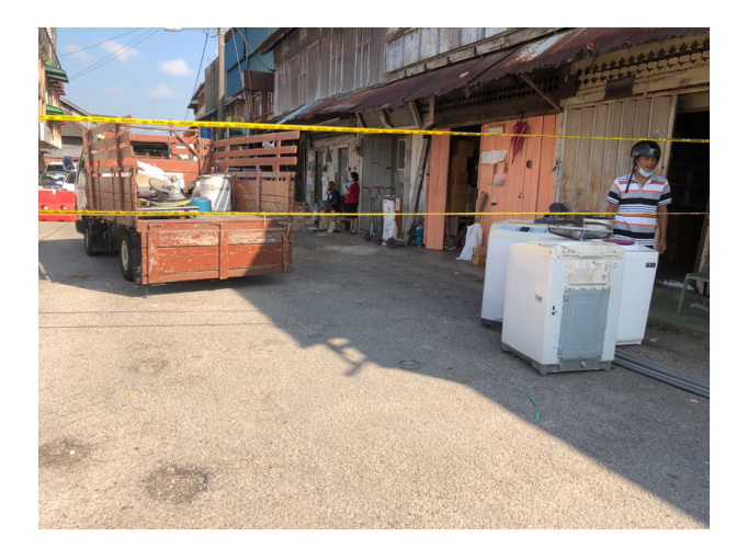
FIGURE 1. Local Community Moving to Safer Locations

Socio-Economic Impact of Riverbank Failure at Kg. Pohon Celagi in Pasir Mas, Kelantan, Malaysia