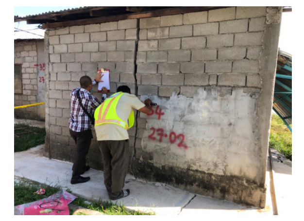
FIGURE 5. Measurement of a Cracked Wall