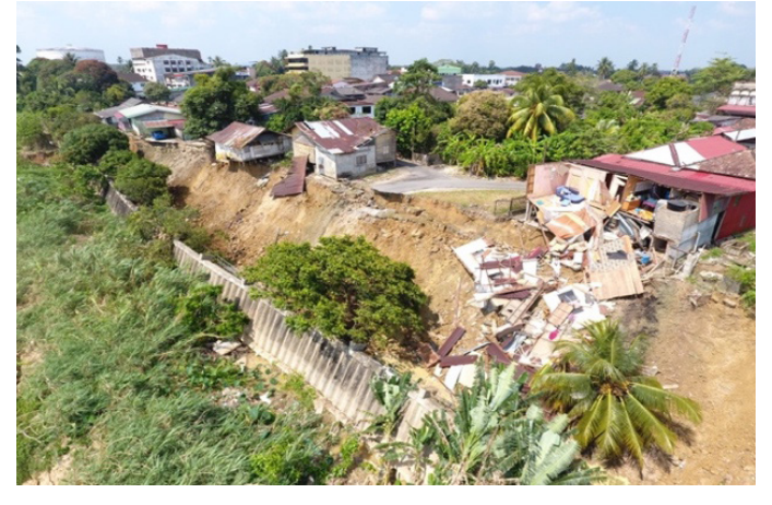
FIGURE 4. Failured Houses and Sheer Pile

range. Figure 4 depicts the 11 houses affected in the red zone. The investigation discovered that a car had collided with the unstable riverbank.