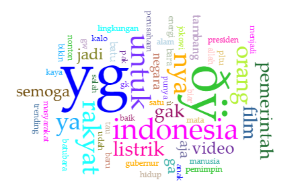
Figure 1: Frequently used words among the youtube comments for "Sexy Killers" movie

The first text analysis of all 21,179 comments in Figure 1. showed that words such as "government" ( pemerintah ), "Indonesia," "citizen" ( rakyat and orang ), "electricity" ( listrik ), "film," and "video" appeared frequently. Besides, terms related to government appeared frequently, such as the name the incumbent President "Jokowi," "president" ( presiden ), "governor" ( gubernur ), and "leader" ( pemimpin ). Words that related to the environment and energy seemed to be use less frequently. Those words include "environment" ( lingkungan ), "energy" ( energi ), "coal" ( batubara/batu/bara ), "nature" ( alam ), and "thermal power plant" (PLTU). Although it appeared somewhat frequently, the word "god" (Allah) was among the most frequently used terms.