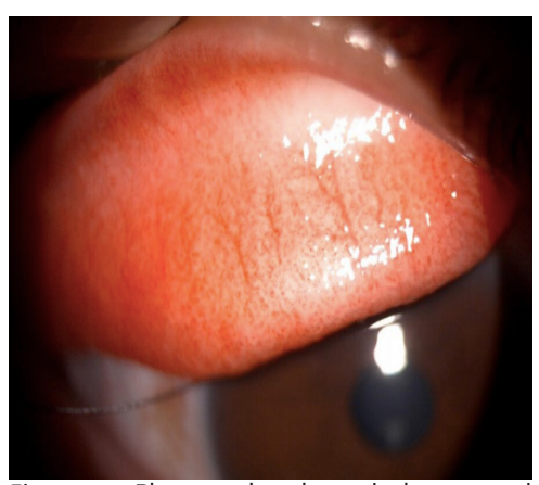
Figure 3: Photographs showed the everted upper eyelids of the patient with completely resolved follicles on the tarsal conjunctiva two weeks after treatment.

red eye are treated by primary care physicians rather than eye care professionals. Primary care physicians should be able to identify whether it is an acute or chronic condition and whether it is associated with any specific risk factors or signs that could lead to a diagnosis. It is important for primary care physicians to examine a thorough history, including ocular, medical and medication history, and