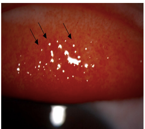
Figure 1: Photographs showing the everted upper eyelids of the patient with presence of follicles on the tarsal conjunctiva before treatment with fucithalmic ointment. Follicles were shown with black arrows.

Conjunctival tissue was excised and sent for culture and sensitivity test, gram stain and direct fluorescent antibody showed (DFA) test. The smears a positive culture for Chlamydia trachomatis. She diagnosed was with bilateral follicular conjunctivitis with filamentous keratoconjunctivitis secondary to Chlamydia trachomatis and she was treated with fucithalmic ointment twice per day and oral