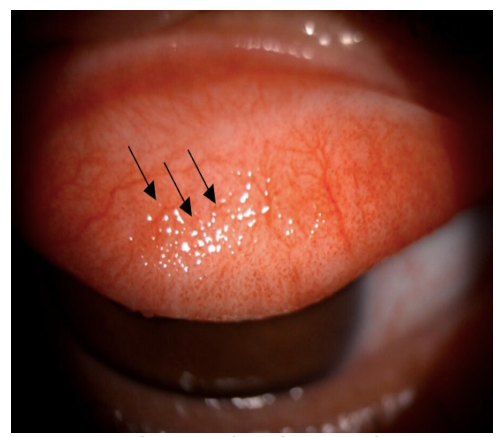
Figure 2: Photographs showed the everted upper eyelids of the same patient with resolving follicles on the tarsal conjunctiva one week after treatment with Fucithalmic ointment. Follicles are shown with black arrows.