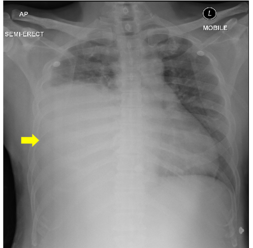
Figure 1: Chest X-ray showed the opacities of the right mid and lower zone (yellow arrow) with trachea deviated to the left.