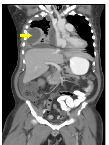
Figure 2: CT scan of thorax showed loculated right pleural effusion with pleura enhancement suggestive of empyema thoracis (yellow arrow). Right lower lobe was completely collapsed. Areas of aerated right upper lobe and middle lobe were seen in between the locules.

thoracotomy and decortication on his tenth day of admission. The intraoperative course was uneventful. Later, his pleural fluid's culture and sensitivity test revealed Streptococcus constellatus. antibiotic The susceptibility test was performed which sensitive to penicillin G. He was then treated with broad-spectrum antibiotic, intravenous meropenem for two weeks. The patient was extubated on day two post-operative and recovered on subsequent days (Figure 3). Patient was allowed to discharge after six weeks completion of the antibiotics.