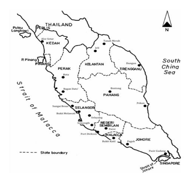
Figure 1. Infographic of JCMM program for 18 locations in Peninsular Malaysia

The present study utilised retrospective methodology and relied on record review data obtained from a community-based eye health screening program 'Jom Check Mata Malaysia (JCMM)'. The target demographic consisted of individuals who participated in the JCMM programme in Peninsula Malaysia. The data pertaining to the participants, which spanned from October 2012 to March 2014, were reviewed and analysed. The record included a total of 18 locations, encompassing the states of Johor, Melaka, Negeri Sembilan, Selangor, Perak, Kedah, Kelantan, Terengganu, and Pahang (Figure 1).