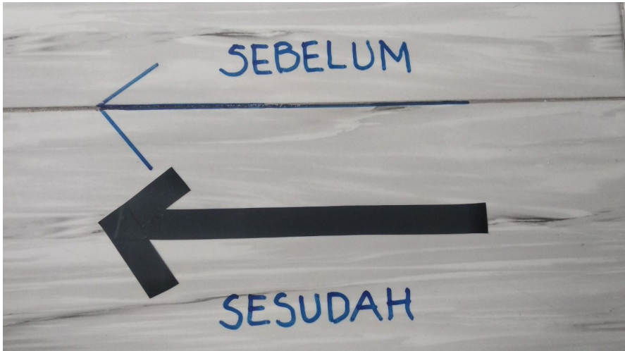
FIGURE 5 Comparison of Qibla Direction Before & After Calibration

From Figure 5 above, it could be seen that there was no deviation that occurred after a comparison was made between the previous and current qibla direction of Nur Murtaji Mosque. Because the method of determining the qibla direction of the Nur Murtaji Mosque uses the qibla azimuth method with the Theodolite instrument carried out by the Ministry of Religion at Bintan, so it can be concluded that the qibla direction of Nur Murtaji Mosque is accurate.