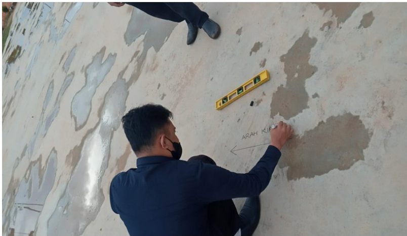
FIGURE 4 Marking Qibla Direction in the Outyard of Nur Murtaji Mosque

After marking the Qibla direction in the outyard of Nur Murtaji Mosque, a straight line was drawn using a thread so that it could reach the floor of Nur Murtaji Mosque. After that, a sign of the qibla direction was made on the floor of Nur Murtaji Mosque so that it could be compared with the previous qibla direction of Nur Murtaji Mosque.