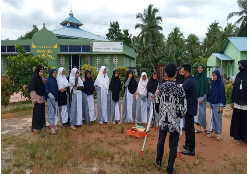
FIGURE 3 Measuring the Qibla Direction of Nur Murtaji Mosque Using Theodolite