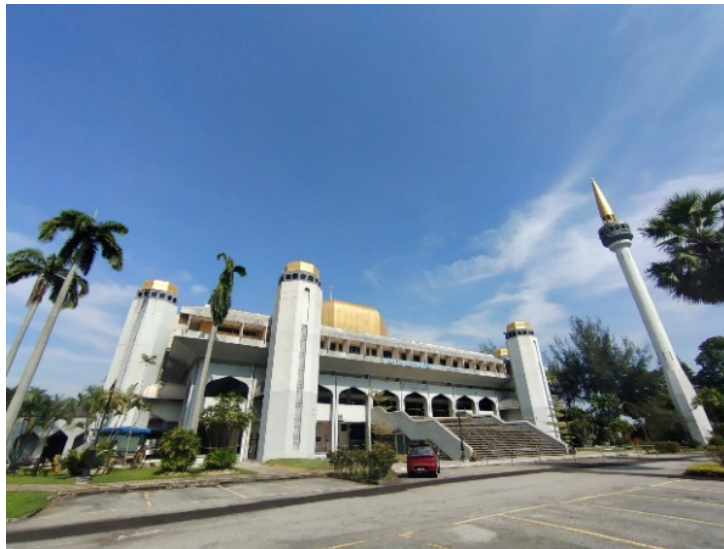
FIGURE 2. The front façade of the mosque with a large staircase and 6.6 meter high minaret.

UKM Mosque was built on a two-hectare site near the UKM's entrance (Figure 1). It is located to the right of the university's main entrance; and on its left is the Chancellor Tun Abdul Razak Hall (DECTAR), which is the UKM's main hall that holds the annual convocation. The arrangement of UKM Mosque on the right, and DECTAR on the left, is a symbolic of the combination of faith and