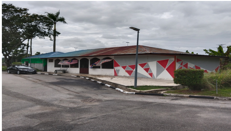
FIGURE 17. Existing ancillary buildings which are not optimized and with poor outdoor appearance.

UKM Mosque is also surrounded by lush landscape and matured trees (Figure 12) that protect the building from direct sunlight, thus keeping the mosque cool. However, more trees shall be planted on the south (at the parking