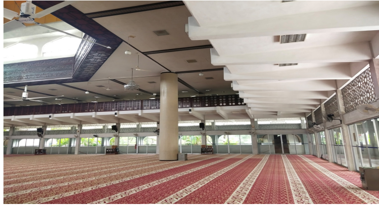
FIGURE 9. The interesting design of the mosque which optimizes natural ventilation and daylighting.

4. To improve the financial sustainability of UIC, to be more sustainable and independent, thus reduce dependency on financial support by UKM.