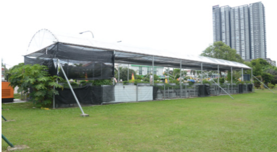
FIGURE 8. Community Farm (Urban Kit Project under Ministry of Science, Technology and Innovation)

The mosque also has its own website which encompasses comprehensive information, including the missions and visions, history, activities, donations and many more. Recently, the mosque was renovated at the estimated cost of approximately four million. (Masjid Al-Hasanah Bandar Baru Bangi 2023).