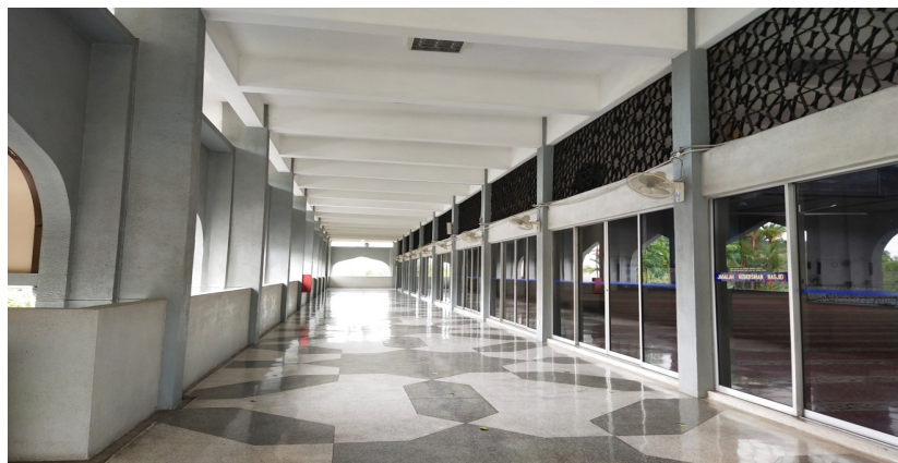
FIGURE 10. Open corridors, metal grills and glass sliding doors along the parameters of the prayer hall.

Therefore, acceptable thermal comfort is possible with the help of ceiling fans (including high volume, low speed (HVLS) fans). The interior spaces (praying areas) are protected from direct sunlight by the wide corridors on each floor. On the second floor, the protruding elements with horizontal and vertical protrusions are provided to protect the floor below and the interior spaces from direct sunlight (see Figure 11).