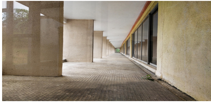
FIGURE 11. Corridors and horizontal and vertical protrusions as a shading device.