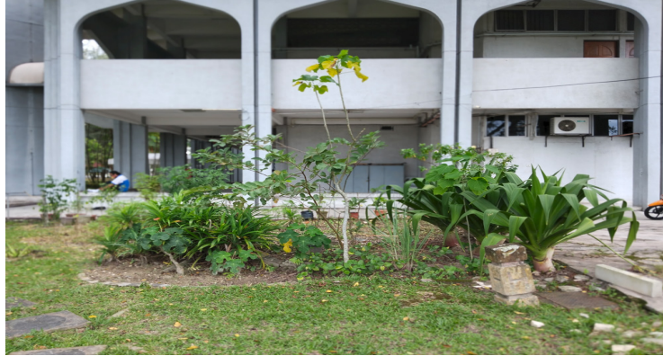
FIGURE 15. Small vegetable garden which and be turned into community farm