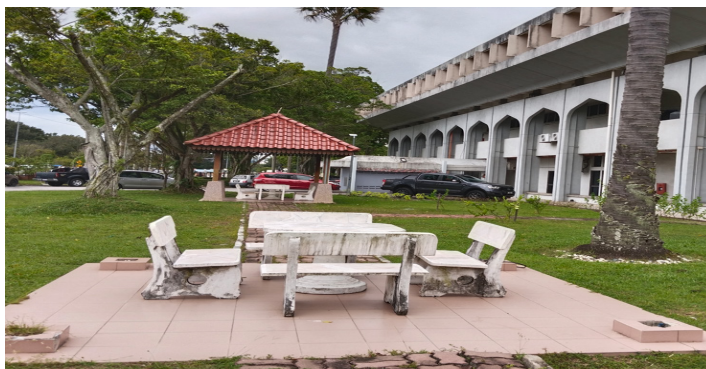
FIGURE 14. Seating area without roof cover.