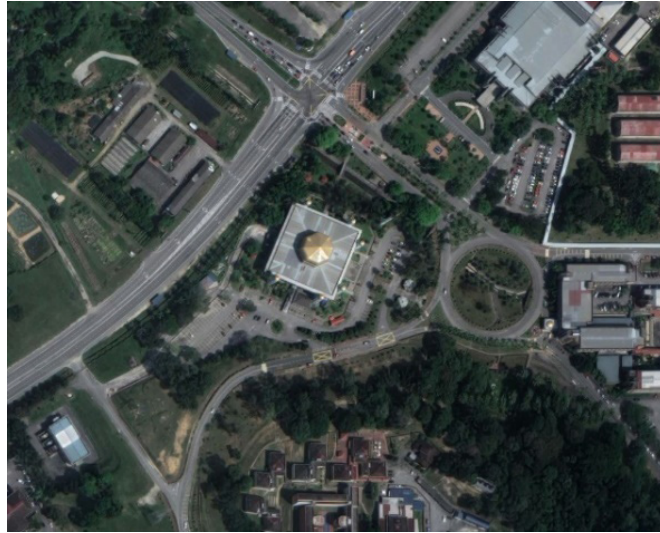
FIGURE 1. The location of UKM Mosque which is adjacent to the university's main entrance

achieved various successes, including in education and research. Around two years later, which was on 16 March 1979, the construction of the UKM Mosque began at Bangi. On Wednesday, 14 April 1982, the mosque was completed and officially handed over to UKM. The mosque is managed by the Islamic Centre of the university, which has been established since 1979 (Pusat Islam UKM 2023).