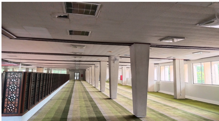
FIGURE 16. The second floor of the mosque which is not optimized due to accessibility issue.