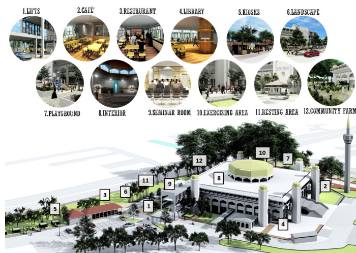
FIGURE 18. Indoor and outdoor 3D perspectives for all 12 improvement proposals to revitalize UKM Mosque.

It is possible to achieve a higher number of visitors as UKM Mosque has great potential. One of the strategies is to have more high-impact and reputable programs, such as seminars, classes as well as courses. It is important for the community to acknowledge UKM Mosque as a center for knowledge dissemination, which is not merely for adults but also for people of all ages. UKM Mosque has to be of world-class quality.