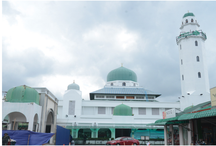
FIGURE 5. Al-Hasanah Mosque at Bandar Baru Bangi

occupied with many activities, which has also attracted many visitors throughout the day, whether during weekdays or weekends.