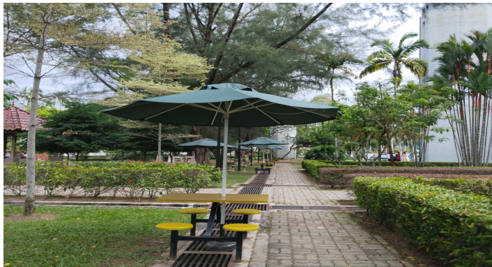
FIGURE 13. Landscape which are less interesting and less appropriate for various students' activities.