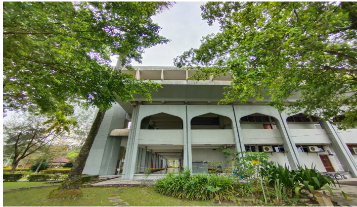
FIGURE 12. Green landscape surrounding the mosque.