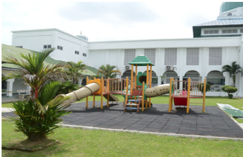
FIGURE 7. Playground at the internal courtyard garden