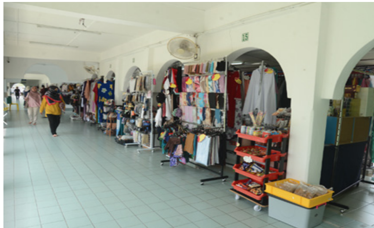
FIGURE 6. Commercial kiosks along the corridor